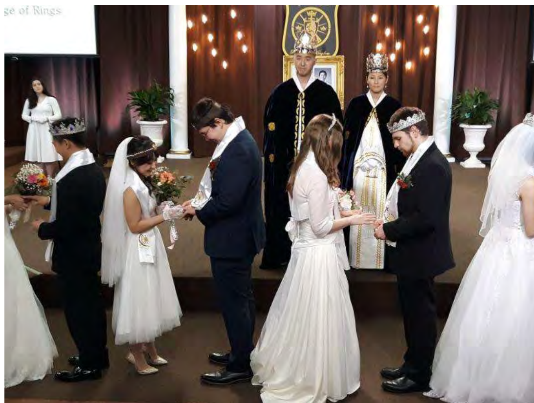
Book of Life Registration Blessing Ceremony 12/30/2018