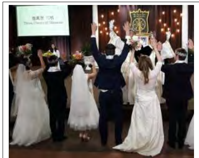
Holy Blessing Ceremony 12/30/2018

I will declare the decree: the Lord hath said unto me, Thou art my Son; this day have I begotten thee. 8 Ask of me, and I shall give thee the heathen for thine inheritance, and the uttermost parts of the earth for thy possession. 9 Thou shalt break them with a rod of iron; thou shalt dash them in pieces like a potter's vessel. Psalm 2:7-9