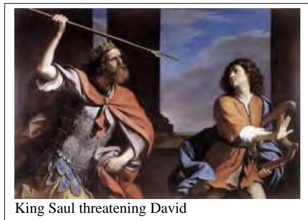
King Saul threatening David

World Peace and Unification Sanctuary - USA