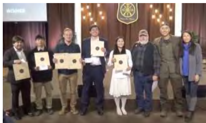
Winners of the Rod of Iron Shooting competition