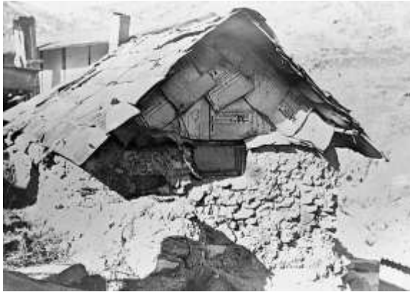
1st Unification Church built by True Father in 1952

World Peace and Unification Sanctuary - USA