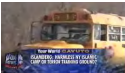
School bus used for target practice in Islamberg in Hancock, NY