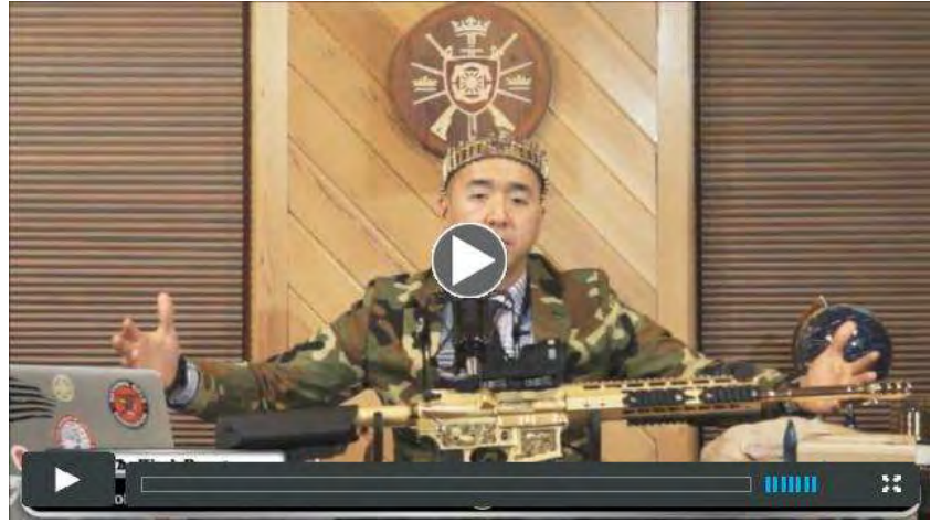
7/23/2018 We Tried to HELP (the Han) MOTHER Not to Turn True Children against Father!