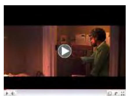
"The War Room" movie trailer

The scripture says, "let no man take your crown!" The title of Father's poem "Crown of Glory" was taken from a bible verse, 1 Peter 5:4. You will face intimidation and ridicule to pressure you to give up your crown, but please realize that God chose you at this time to fight with Him.