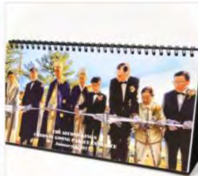
2017 Desk Calendar $20.00