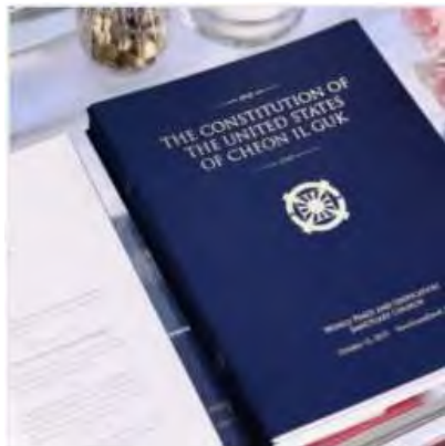
Cheon Il Guk Constitution