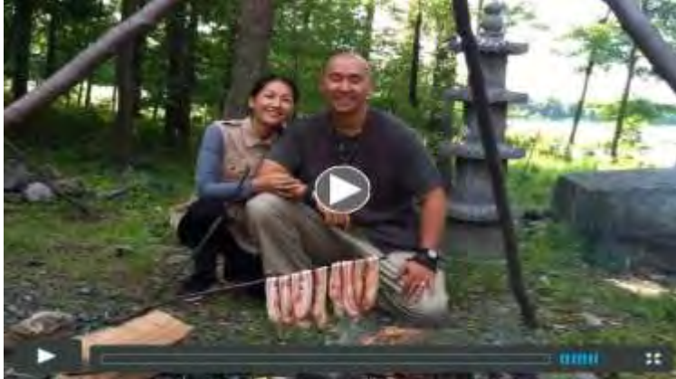
Hyung Jin Moon on Building a Successful Marriage