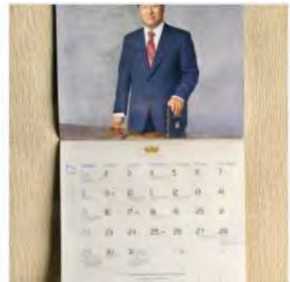
2017 Wall Calendar $25.00