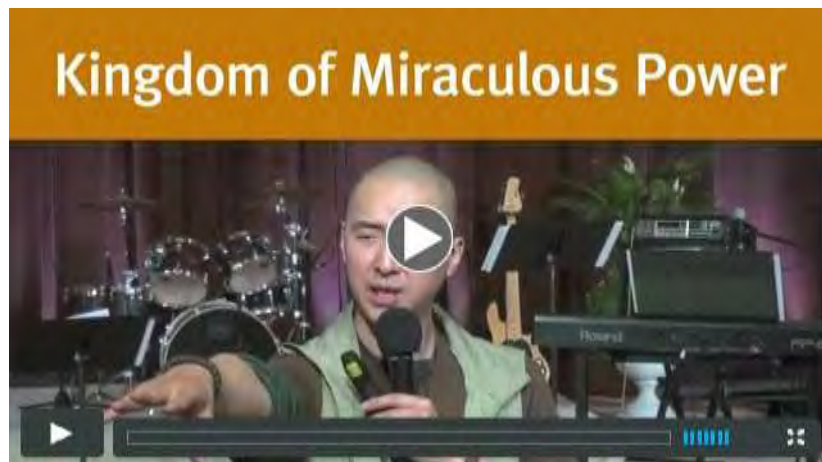
April 9, 2017 Unification Sanctuary Sermon, Rev. Hyung Jin Moon

The kingdom of God is not just in words, but in power, drawing on the "ruach" or invisible breath of God. Evil grows when good people are emasculated, do not stand up for what is right. Men must take up their responsibility as protectors, "sheep dogs" and "peace police" of their families, communities, nation and God's Kingdom.