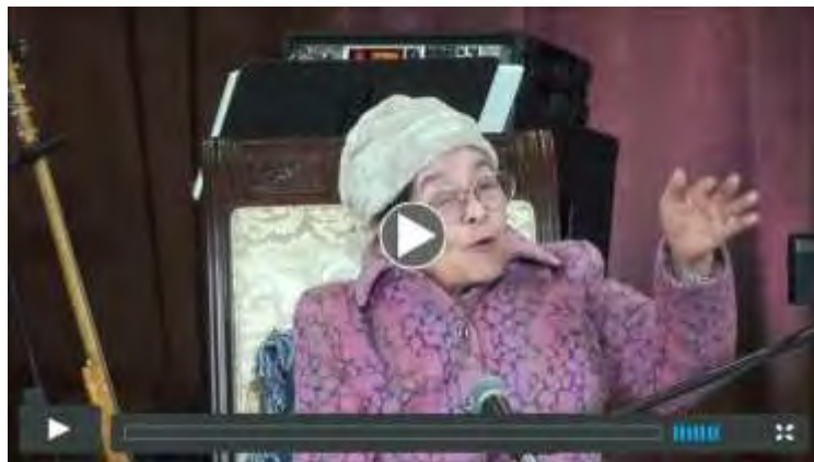
Sanctuary Church Sunday Service, January 8th, 2017