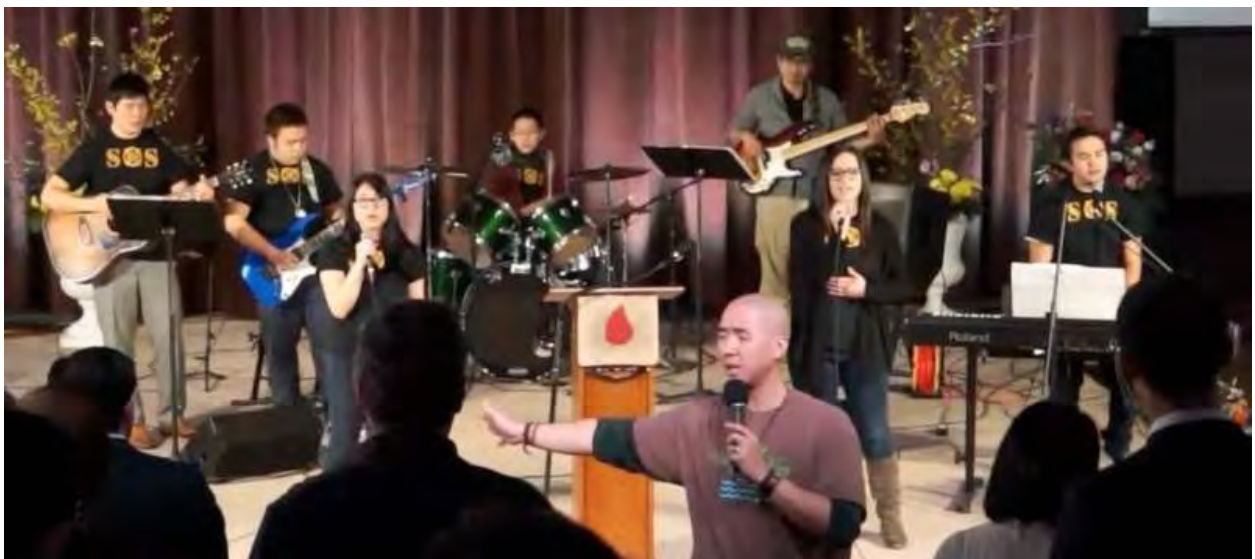
2/14/2016 Unification Sanctuary Worship Service

God has many people prepared to receive the Lord of the Second Advent. God's prophecy that in the end times, the last will be first and the first will be last is coming true at this time. At the end of God's providence, everything moves faster. We do not control time, God does.