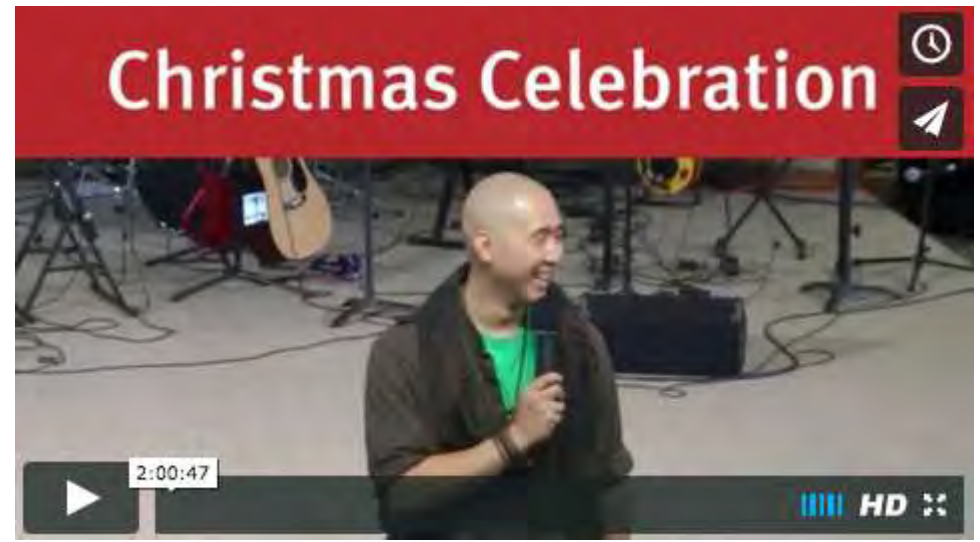
Sanctuary Christmas Worship, 12/20/2015

Father also eschewed the palace in favor of the Amazonian jungle or the wide, open ocean, living constantly in the "midbar" of nature where you are not in control. He was constantly making effort to break up monopolies and hierarchies in the Unification Movement.