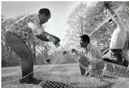
Father signing Barrytown College proposal in April, 2012 ▶