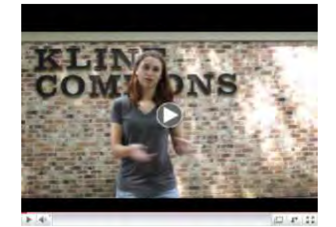
Boys and (mostly) Girls