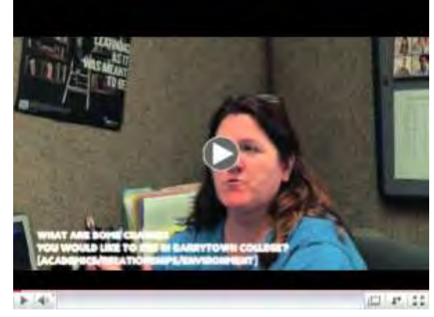
3 perspectives on Barrytown College

Here is more information about this <u>summer's Media</u> <u>Institute</u> as well as links to other videos created by students.