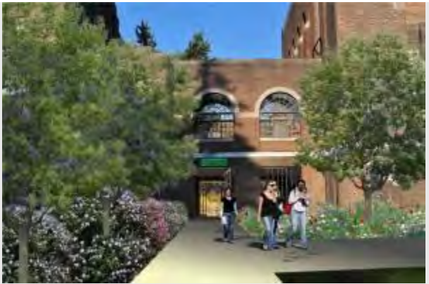
New NW Entrance (photo)

Funding for the college startup is being sought from bond financing to raise $7 million dollars for the first 5 years of construction and operation.