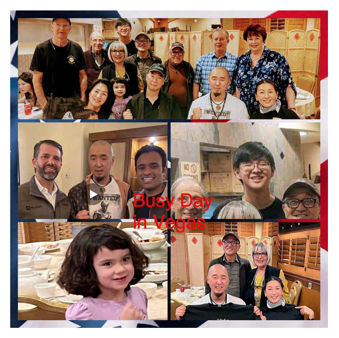
Online LOVESMARTS Teen SEMINAR Intro