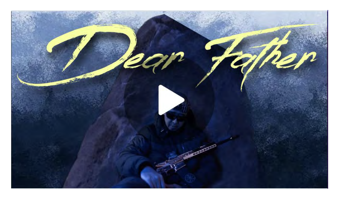
Dear Father Music Video