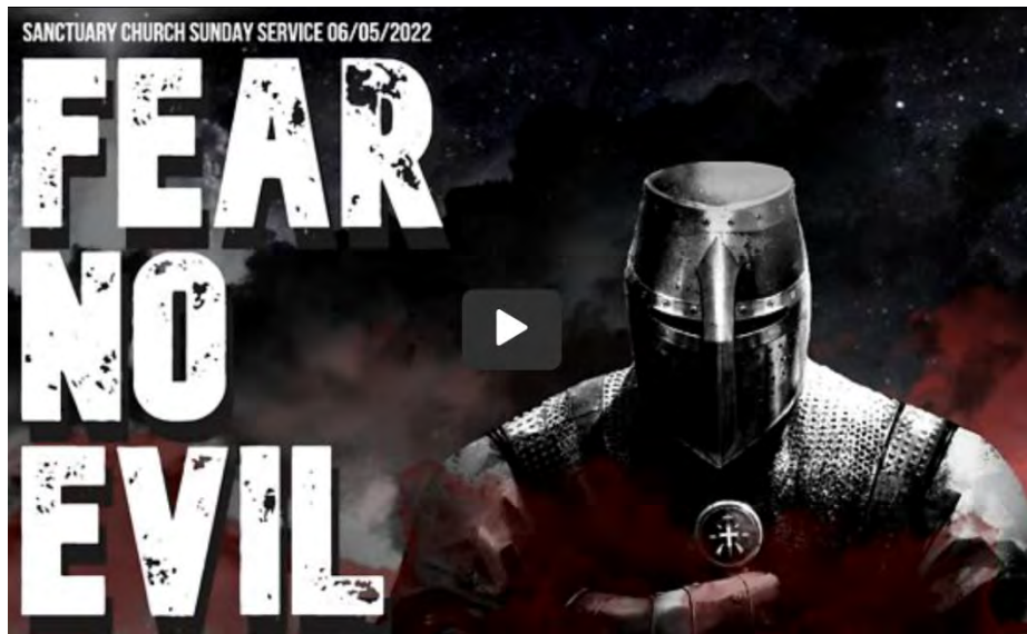
Unification Sanctuary Service 6/5/2022

Many expected worldwide prosperity to continue, and mocked his advice to move to the countryside. Then all of a sudden, in 2020, we saw worldwide pandemic lockdowns. We even see world leaders and western business elites praise China's model of total control, even welding doors shut so citizens cannot leave their apartments during a viral outbreak. Trudeau and other leaders praise the speed with which China can take action without having to go through a democratic process. Trudeau has just called for the banning of the sale of handguns throughout Canada.