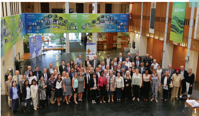
1 Participants and speakers in the Ecumenical Center after the end of the conference