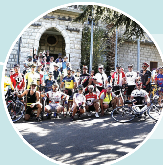
Peace Road bikers in front of Hammana Municipality 1200m above sea-level with welcoming remarks by the mayor.