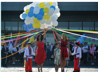
On September 20, 2018, UPF-Ukraine held its fifth Junior Ambassadors for Peace Congress dedicated to the UN International Day of Peace, featuring a performance by the “Angels Over Ukraine”.