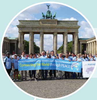
The Peace Road participants - bicyclists and walkers alike - by the Brandenburg Gate