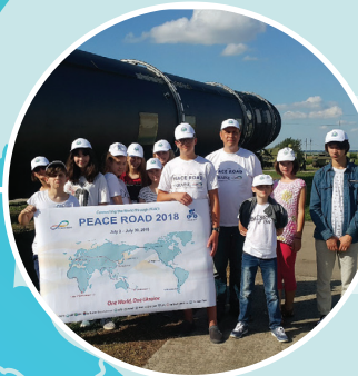
The participants visit the Strategic Missile Forces Museum to view an SS-18 intercontinental ballistic missile.