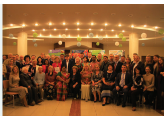
Participants of the 2018 International Day of Peace celebration held at the UPF Peace Embassy in Moscow.