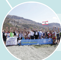
Peace Road participants at the Hammana Sporting City.