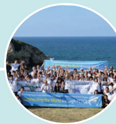
Peace Road Turkey participants at Sile on the Black Sea coast.