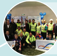
The final stage of the round-the-world bicycle tour "Peace Road" was celebrated in Kazan, Russia.