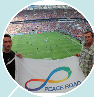
The Peace Road flag is unfurled inside Moscow's Luzhniki Stadium before the final match of the 2018 World Cup.