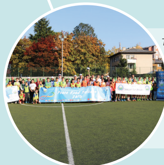
The first stage of the Balkans Peace Road concluded with a Football for Peace tournament in Bosnia Herzegovina.