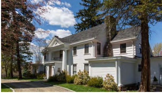
Belvedere's White House