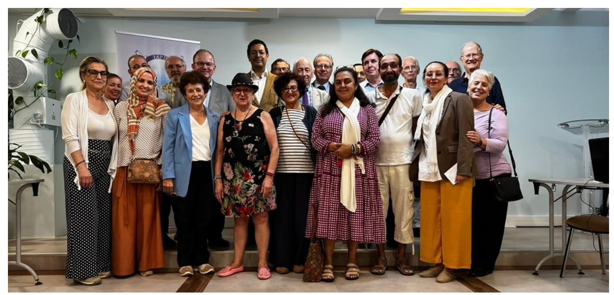
Some of the speakers and participants at Espace Barrault, Paris.