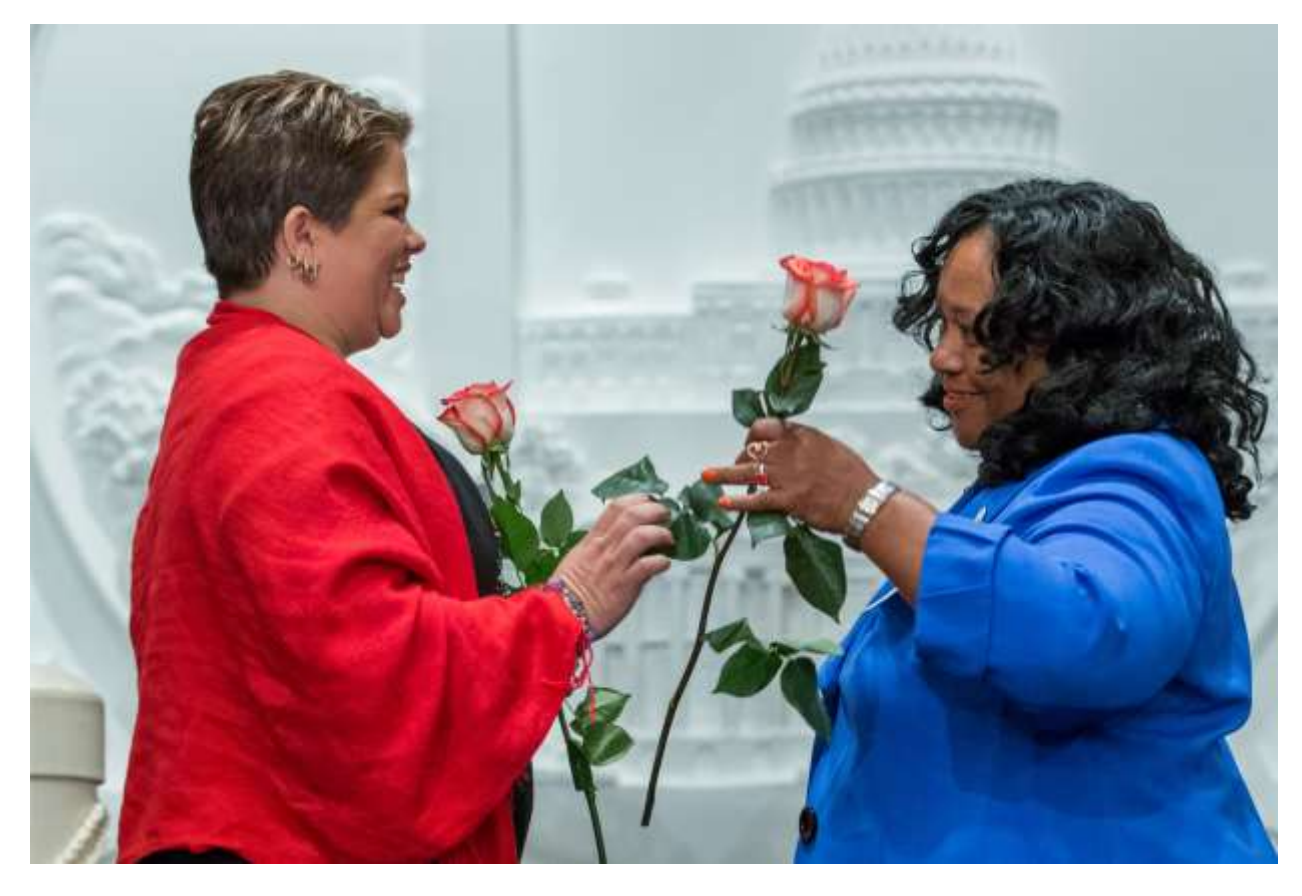
"WFWP must someday develop into a federation of families for world peace," True Mother said, with

Over the last three decades, WFWPI has become an eminent global women's organization with members in some 143 countries. In 1994 alone, more than 200,000 Korean and Japanese women came together to create "sisterly ties" through 38 events organized by WFWPI. Then in 1995, WFWPI's "sisterhood ceremonies" transformed into "bridge crossings" that to date have brought together hundreds of thousands of women from around the world.