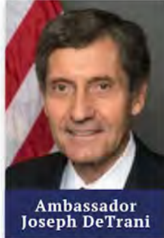
Ambassador Joseph DeTrani Security issues commentator; Former Special Envoy for negotiations with North Korea