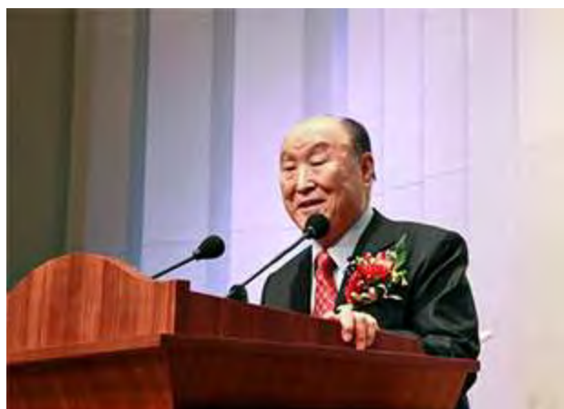
True Father speaks at the opening of the Cheon Bok Gung

True Parents dedicated the Cheon Bok Gung, or "Unification Peace Temple," on February 21, 2010. In 2008, True Father had called for the establishment of a 20,000-member church in Seoul that would serve as a platform to influence the nation. He later increased the goal to a 210,000-person congregation that would influence Korea and eventually the world, not just socially and culturally but also spiritually. Efforts to construct a "growth-stage" Cheon Bok Gung began in earnest with the acquisition of a large public building in Seoul's Yongsan district. The church's worldwide membership, led by Japan and Korea, donated nearly $100 million for the purchase and subsequent renovation costs. This was completed in early 2010, and Unificationists undertook an hour-long march from the previous church headquarters to the new sanctuary, which also would serve as International and Korean church headquarters. In his dedication prayer, True Father prayed that the Cheon Bok Gung "become the candlelight in a garden around which all people who resemble heaven in heart can assemble. ... Let it serve as an ecumenical foundation and become the temple embodying the original essence of Your exemplary love as it governs beyond all people and the universe."