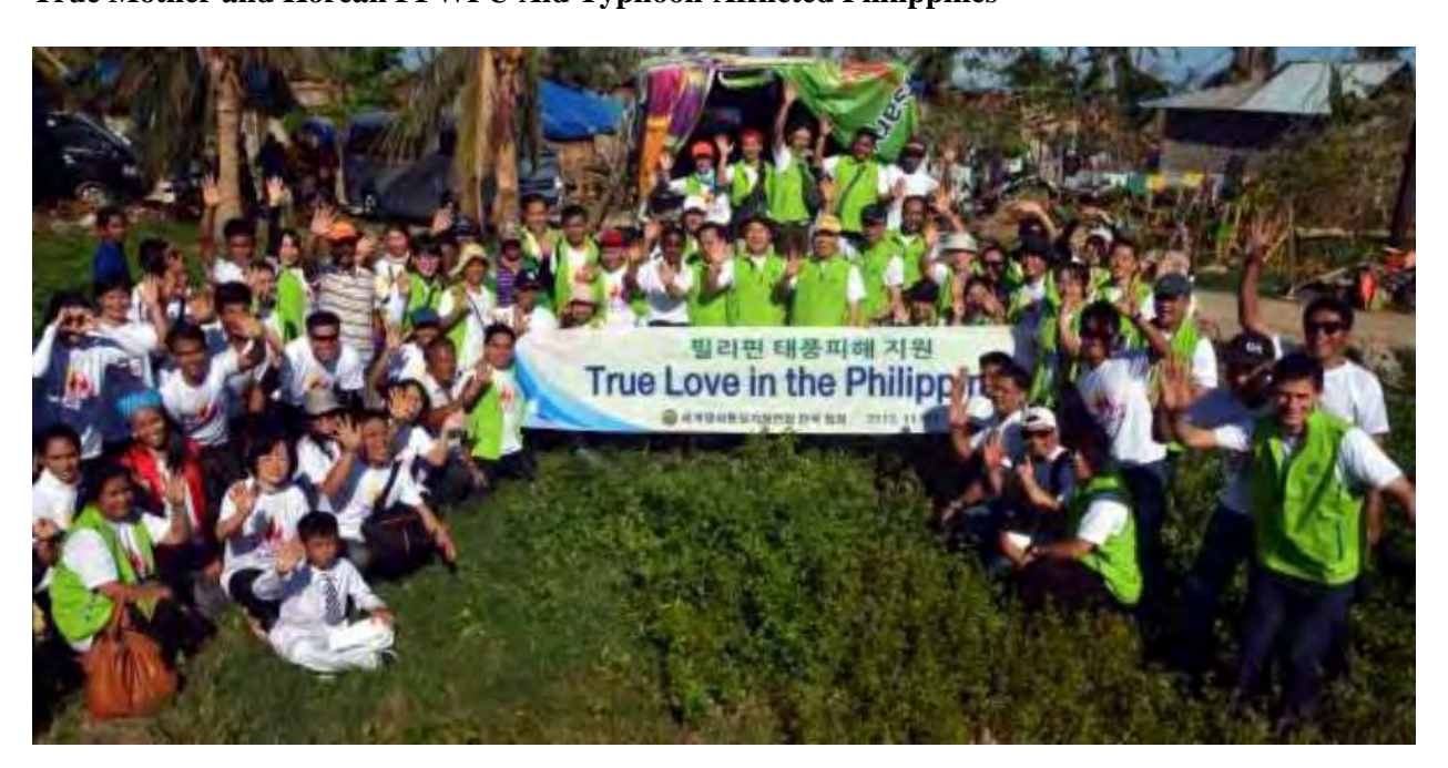
December 10, 2013 True Mother and Korean FFWPU Aid Typhoon-Afflicted Philippines

Super Typhoon Haiyan -- one of the strongest storms recorded on the planet -- smashed into the Philippines on November 8, 2013. The deadliest <u>Philippine typhoon</u> recorded in modern history, it killed at least 6,300 people. The international community responded generously with monetary aid and aid workers. One Unificationist city leader was killed and 100 members in the Philippines' central region