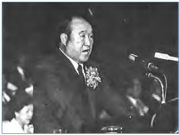
True Father delivers the Citizens' Federation Founder's Address

The "Danbury Course" was decisive in sparking widespread grassroots support for True Father across the United States from minority communities and those concerned about religious and civil liberties. In fact, a broad spectrum of 1,600 clergy and prominent laypeople welcomed True Father back from prison at a "God and Freedom" banquet held in his honor at the Omni Shoreham Hotel in Washington, D.C. A similar event occurred in Korea on December 11, 1985, when some 2,300 dignitaries from a diversity of fields, including a former prime minister of the Republic of Korea, attended a welcoming banquet at the Hilton Hotel Convention Center to pay tribute to the conclusion of True Father's 40-year ministry and to welcome him back to his homeland. Prime Minister Yasuhiro Nakasone of Japan and five former presidents of Latin American countries presented gifts and plaques of appreciation. From this point, True Parents initiated activities in Korea through the Korean Root-Finding Association, the Citizens' Federation for the Unification of the Fatherland, the Segye Ilbo newspaper, business investments and cultural work that would culminate in his meeting with North Korean President Kim Il Sung in 1991.