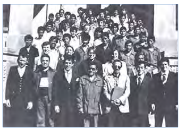
Shortly after its launch, CAUSA holds a workshop for students in Bolivia