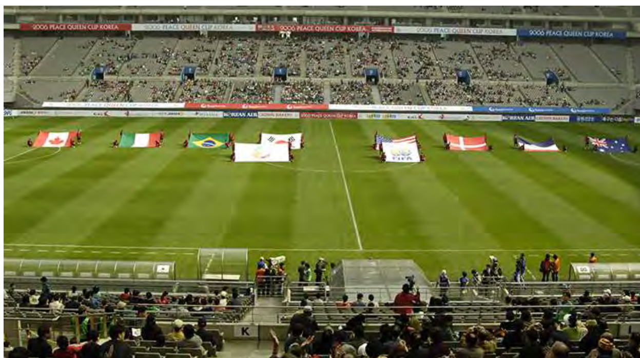
The Inaugural Peace Queen Cup Tournament is held in South Korea

Following the 2002 World Cup soccer tournament jointly sponsored by Korea and Japan, True Father established the Sun Moon Peace Football Foundation. It sponsored a Peace Cup invitational soccer