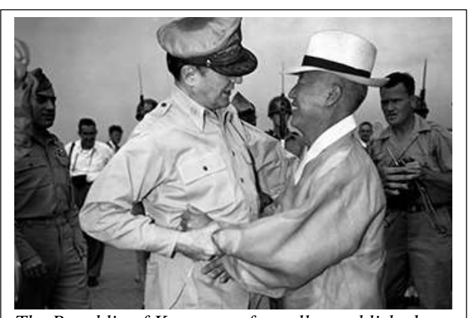
The Republic of Korea was formally established, with Syngman Rhee as president, August 15, 1948

After Japan's surrender to the Allied powers, Korea did not gain its independence. Instead, the USSR and the U.S. established separate trusteeships divided at the 38th parallel. In effect, Korea was subjected to Soviet and U.S. military occupations. This fomented discontent, especially among Korean patriots. The UN General Assembly called for a UN-supervised general election, but this was rejected. A general election for a Constitutional Assembly was held in the South, a constitution was adopted, and on August 15, 1948, the Republic of Korea was formally established, with Syngman Rhee as the first president. Less than a month later, a communist regime, the