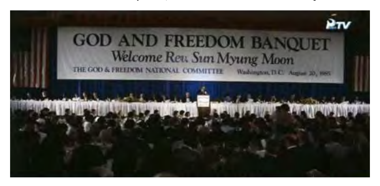
August 20, 1985 True Father Released from Halfway House, Welcomed at "God and Freedom" Banquet

True Father's "Danbury Course" consisted of his indictment, trial, appeal and imprisonment on tax evasion charges. It was his sixth imprisonment and one of the most unjust. True Father was incarcerated at the Danbury Federal Correctional Institution in Connecticut from July 20, 1984, to July 4, 1985, and then from July 4, 1985, to August 20, 1985, at Phoenix House Foundation Inc., a halfway house in the New York City borough of Brooklyn.