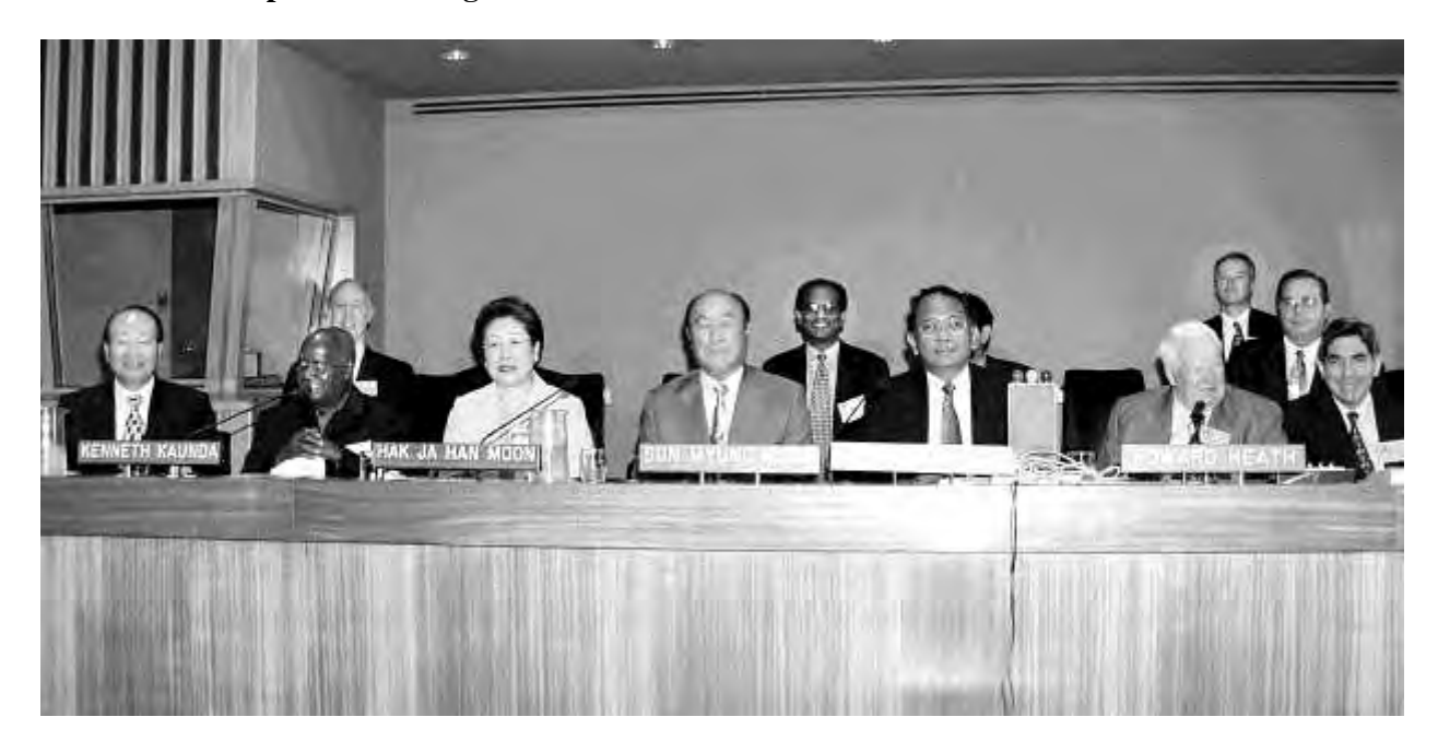
August 18, 2000 True Father Proposes Interreligious Council at the United Nations

The United Nations convened a Millennium Summit, from September 6 to 8, 2000, which was the largest gathering of world leaders in history to that date. It resulted in the UN Millennium Declaration and UN Millennium Development Goals. Prior to that meeting, the Unification movement convened Assembly 2000 from August 17 to 19 at the New York headquarters of the United Nations. It was co-sponsored by the Permanent Missions to the UN of Indonesia, Uganda and Mongolia under the theme "Renewing the United Nations and Building a Culture of Peace." More than 400 world leaders from over 100 nations attended, including Oscar Arias, former president of Costa Rica and Nobel Peace Prize laureate; Robert Dole, former U.S. Senate majority leader and Republican presidential candidate; the late Sir Edward Heath, former prime minister of the United Kingdom; Kenneth Kaunda, former president of Zambia; and Richard Thornburgh, former UN undersecretary general and governor of Pennsylvania.