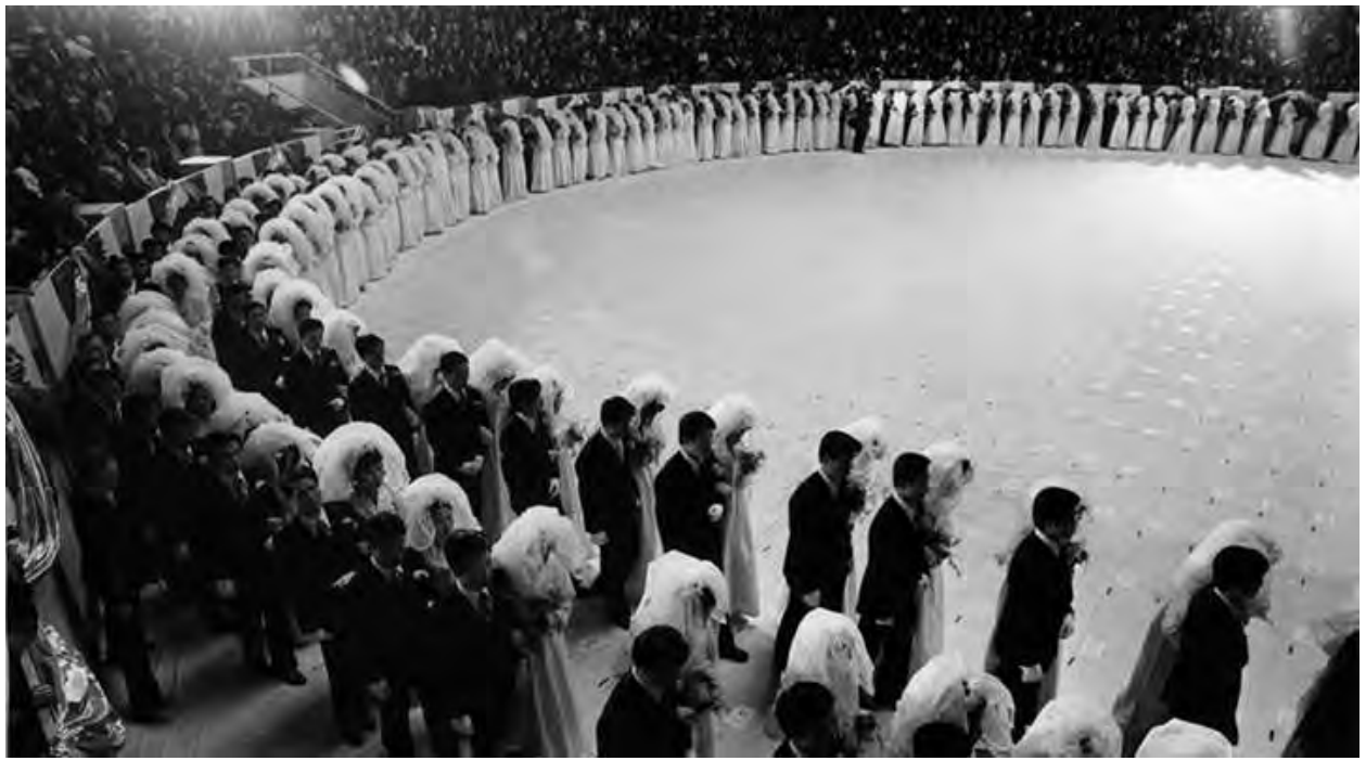
True Parents bless 1800 couples in marriage.

True Parents blessed 1,800 couples (technically, 1801) in what the Guinness Book of World Records then