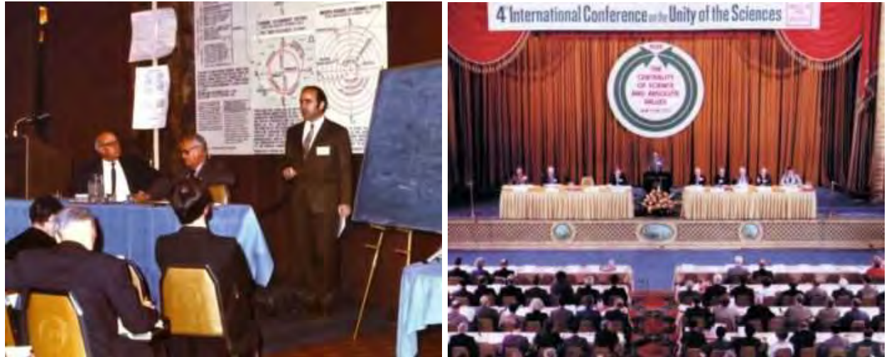
First ICUS meeting in 1972.

February 4, 2017 True Mother Revives ICUS