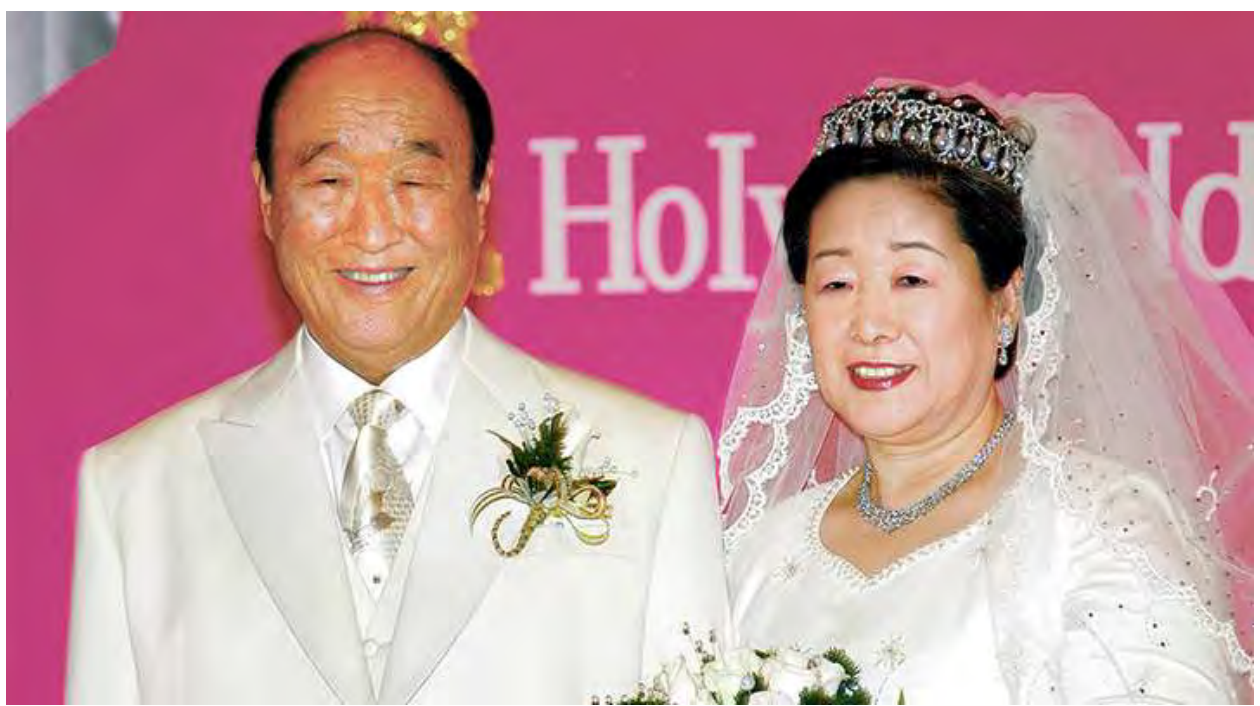
The Holy Marriage Blessing Ceremony for the Parents of Heaven and Earth Opening the Gate of Cheon Il Guk

Holy Marriage Blessing Ceremony for the Parents of Heaven and Earth Opening the Gate of Cheon Il Guk