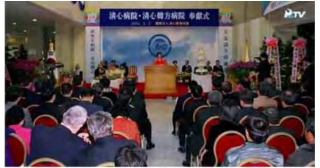
True Mother speaking at the hospital dedication ceremony

A ceremony was held to offer Cheongshim International Hospital to Heaven on February 5, 2003. The construction began in September 2000 and was finished after two years and five months. True Parents bestowed on the hospital the motto "Perfection of unification with heavenly character is possible through united mind and spirit." Through her congratulatory remarks, True Mother said, "The Chung Pyung Heaven and Earth Training Center and the Cheongshim International Hospital are the homeland for the hearts of Unification families around the world." Located in a beautiful mountain landscape, Cheongshim International Hospital serves its patients with both Western and Oriental medicine and the most up-to-date equipment.