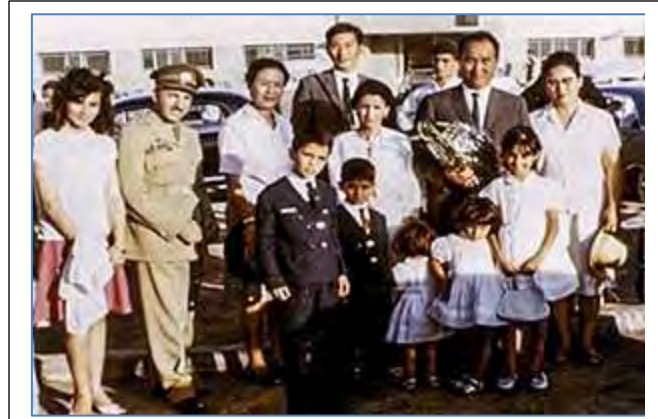
True Father visits Jordan prior to crossing over to Israel during his first World Tour