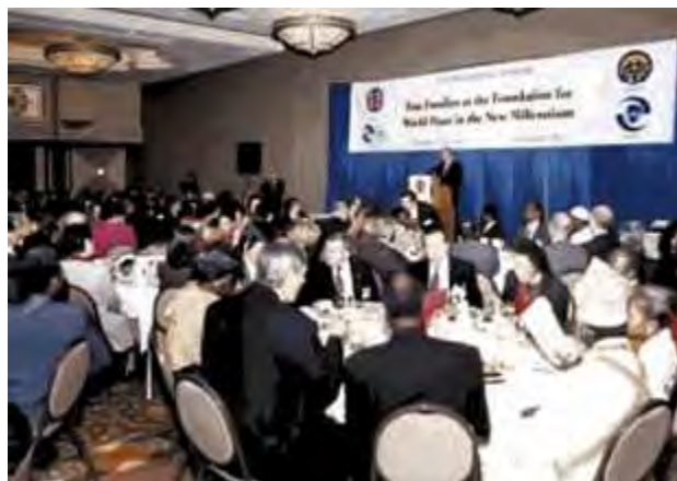
A Hoon Dok Hae conference is held in Washington D.C. in 1999

On September 1, 1997, True Father proclaimed a "New Start." He began a tradition where all Unificationist families set aside one hour each morning from 6:00 to 7:00 to recite the Family Pledge (the core pledge of Unificationists), and then hold a daily study and discussion of his words. On October 13, 1997, True Father named the daily morning reading tradition Hoon Dok Hae, which was understood to be a "gathering for reading and learning." In addition to being a cornerstone of morning devotions, the church sponsored Hoon Dok Hae conferences for civic and religious leaders that focused on "reading and learning" True Father's words. True Father's words would later become the basis for the Cheon Seong Gyeong (2004) or "Heavenly Scripture."