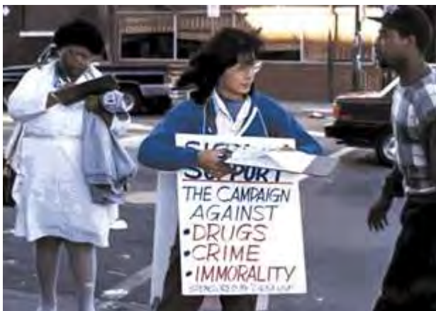
A woman collects signatures for CAUSA USA

True Father planned to conduct a Moscow rally by 1981, but this was prolonged for nearly a decade due to court battles in the United States and the need to build up a stronger church. Having concluded the "Danbury Course" and established a multifaceted presence in America by 1985, True Father mounted a march to Moscow from 1985 to 1990. He understood that the Soviets respected strength and that any