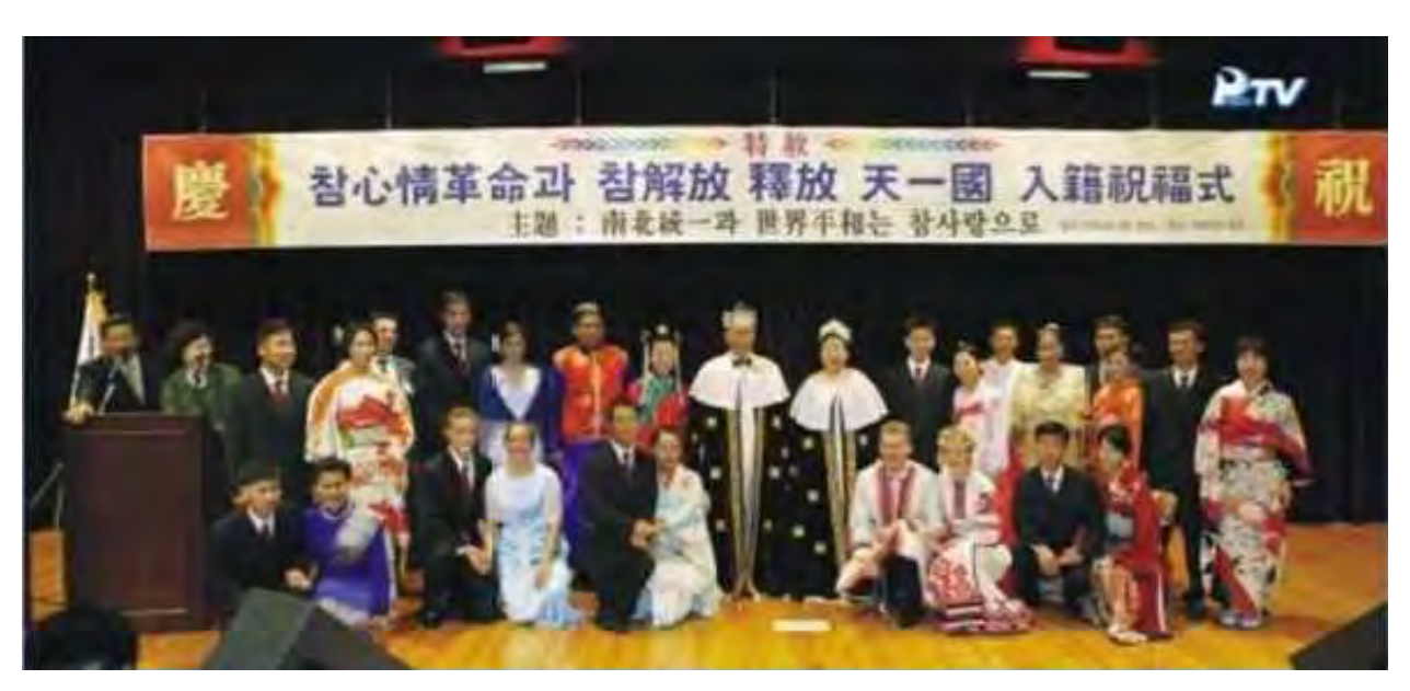
August 20, 2004 Coronation of True Parents as the King and Queen of Peace

In May 2003, Christian clergy responded to True Parents' call and went to Israel, where they repented together with Jewish and Muslim leaders for not having understood one another as brothers. On the foundation of the penitent heart demonstrated by representatives of the three Abrahamic faiths, True Parents called for the founding of the "Fourth Israel" -- a new body of "chosen people" who were anointed by God. True Father offered Holy Wine on this special August 20 celebration, and all who partook of this covenant not only were engrafted into the lineage of heaven and the True Olive Tree but also became the "Fourth Israel," a new "chosen people of all races, religious faiths, and peoples."