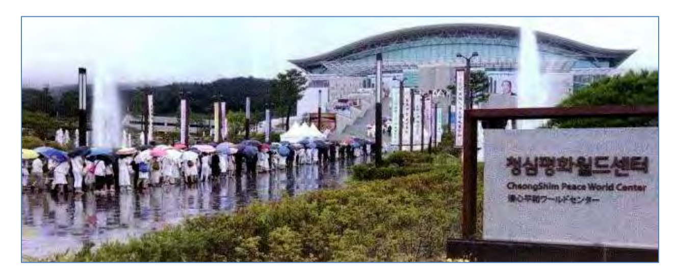
August 23, 2013 First Anniversary of True Father's Universal Seonghwa (Ascension)

Some 25,000 Unificationists, national-level leaders, academics and clergy from 60 countries attended the first anniversary of True Father's Universal Seonghwa at the Cheongshim World Peace Center in Gapyeong, Korea on August 23, 2013. Those who could not physically attend the event participated via live Internet broadcast, which was sent out to 193 nations. Numerous events and exhibitions commemorating the life and achievements of True Father preceded the occasion, including a Keepsake Exhibition that included 120 personal items such as True Parents' wedding clothes from 1960 and the suit True Father wore during his meeting with North Korean Premier Kim Il Sung. The Memorial Ceremony included remarks by visiting dignitaries. The Hon. Jose de Venecia, former Speaker of the House in the Philippines said he "couldn't imagine" Rev. Moon passing away given his "endless enthusiasm" and "superhuman energy." At the same time, he noted, "I never met Father Moon when Mother Moon was not by his side. They were inseparable ... We are blessed that Mother Moon, who knows Father Moon better than anyone else does, is herself standing strong in carrying on the great work that Father Moon began." A highlight of the second part of the memorial was a musical gala performance, "Crown of Glory," which depicted True Parents' life course. Songs that True Father loved were sung and True Mother stated, "It feels as if True Father might stride forward with a bright smile and ask, 'How have you been?'"