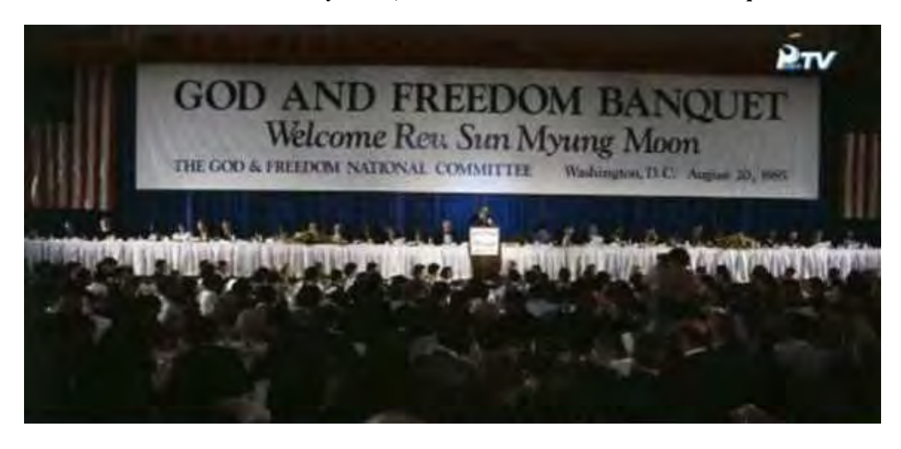
August 20, 1985 True Father Released from Halfway House, Welcomed at "God and Freedom" Banquet

True Father's "Danbury Course" consisted of his indictment, trial, appeal and imprisonment on tax evasion charges. It was his sixth imprisonment and one of the most unjust. True Father was incarcerated at the Danbury Federal Correctional Institution in Connecticut from July 20, 1984, to July 4, 1985, and then from July 4, 1985, to August 20, 1985, at Phoenix House Foundation Inc., a halfway house in the New York City borough of Brooklyn.