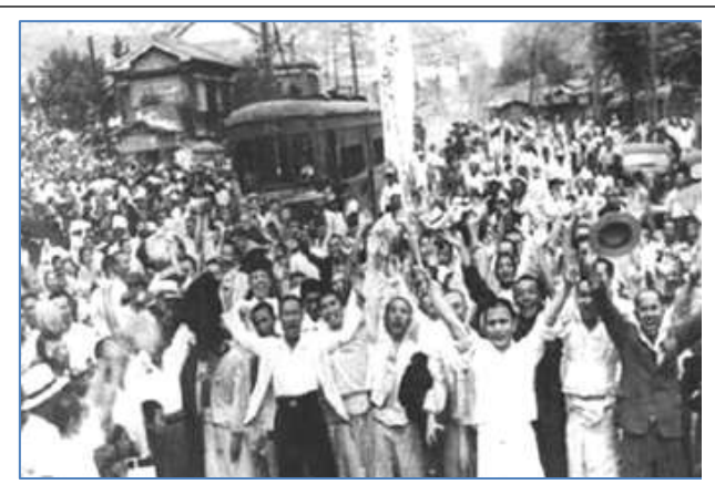
A photo commemorating the Independence Day of Korea

Imperial Japan surrendered on August 15, 1945, bringing World War II to an end. The war's end sparked nationwide rejoicing in Korea, which had been under Japanese occupation for 40 years. Unificationists regard August 15, 1945 as the beginning of True Father's public ministry. According to True Father, "The end of World War II was a unique time in human history." It was, he stated, "the ideal time for the Second Advent." At the same time, there were formidable challenges. Korea was occupied by new powers, the USSR in the North and the U.S. in the South. There was political chaos and social disruption as several million refugees returned. In addition, Korean churches were disunited, divided between those