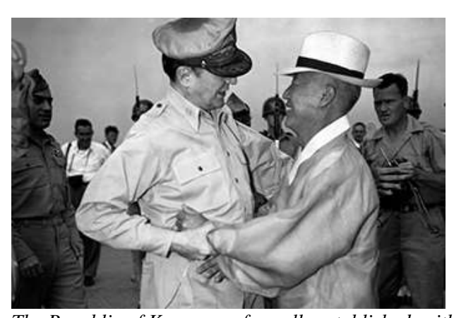
The Republic of Korea was formally established, with Syngman Rhee as the first president, August 15, 1948

After Japan's surrender to the Allied powers, Korea did not gain its independence. Instead, the USSR and the U.S. established separate trusteeships divided at the 38th parallel. In effect, Korea was subjected to Soviet and U.S. military occupations. This fomented discontent, especially among Korean patriots. The UN General Assembly called for a UN-supervised general election, but this was rejected. A general election for a Constitutional Assembly was held in the South, a constitution was adopted, and on August 15, 1948, the Republic of Korea was formally established, with Syngman Rhee as the first president. Less than a month later, a communist regime, the Democratic People's Republic of Korea, was proclaimed under Kim II Sung in the North. The division of Korea during the years 1945-48 was a political and providential failure. True Father traveled north in 1946 to avert this. In the end, he was arrested and spent nearly three years in a North Korean labor camp, liberated only after the outbreak of the Korean War, which resulted in a death toll of over 1.2 million.