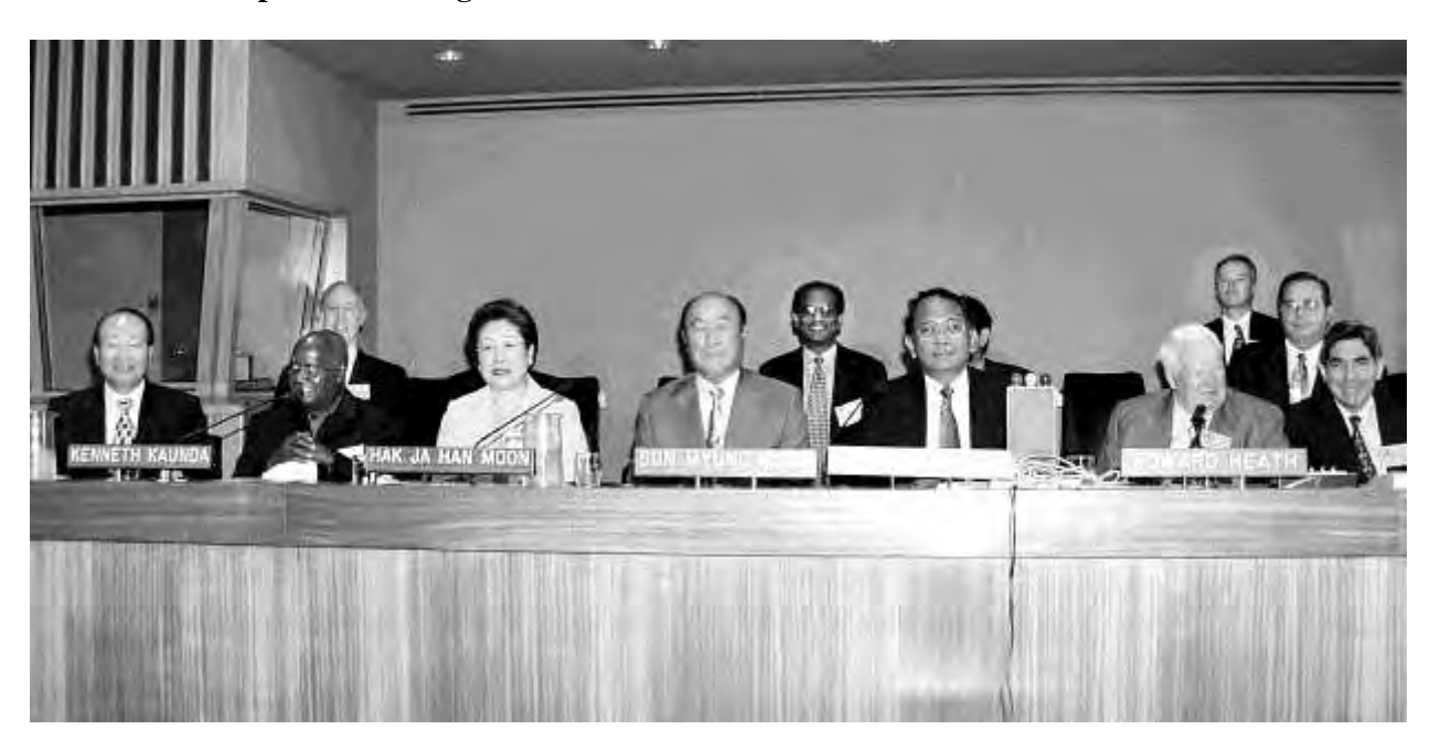
August 18, 2000 True Father Proposes Interreligious Council at the United Nations

The United Nations convened a Millennium Summit, from September 6 to 8, 2000, which was the largest gathering of world leaders in history to that date. It resulted in the UN Millennium Declaration and UN Millennium Development Goals. Prior to that meeting, the Unification movement convened Assembly 2000 from August 17 to 19 at the New York headquarters of the United Nations. It was co-sponsored by the Permanent Missions to the UN of Indonesia, Uganda and Mongolia under the theme "Renewing the United Nations and Building a Culture of Peace." More than 400 world leaders from over 100 nations attended, including Oscar Arias, former president of Costa Rica and Nobel Peace Prize laureate; Robert Dole, former U.S. Senate majority leader and Republican presidential candidate; the late Sir Edward Heath, former prime minister of the United Kingdom; Kenneth Kaunda, former president of Zambia; and Richard Thornburgh, former UN undersecretary general and governor of Pennsylvania.