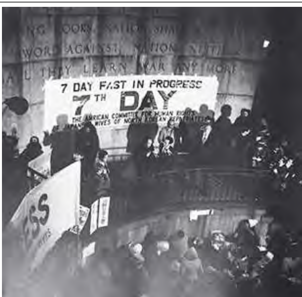
True Father at the conclusion of the 7-day fast

Seven hundred Unificationists fasted for seven days in front of the United Nations in New York from October 21-27, 1974, to protest the treatment of Japanese wives of North Korean repatriates. True Father initiated the fast for humanitarian and providential reasons. He noted that Korean men living in Japan who married Japanese women and then repatriated to North Korea had "cheated" the wives who were "now ill-treated and persecuted under the regime." In this connection, the Unification Church published a volume of testimonies from these women, If I Had Wings Like a Bird, I Would Fly Across the Sea , which publicized their plight. Apart from the humanitarian issue, Unificationists undertook the fast within the context of a North Korean proposal, which had gained traction in the UN General Assembly, that called for UN forces to be removed from South Korea. True Father stated that the fast's