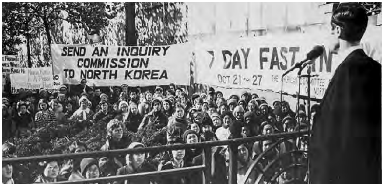
Protestors hold a 7-day fast on behalf of wives in North Korea.