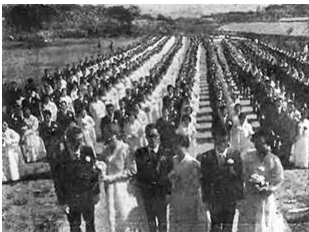
Rehearsal of the International Wedding Ceremony of 777 couples at Sutaek Ri

True Parents presided over the first truly international Marriage Blessing Ceremony when they blessed 777 couples on October 21, 1970. As part of the 430 Couples Holy Marriage Blessing in 1968, True Parents blessed 43 non-Korean couples overseas in 1969. For the 777 Couples Holy Marriage Blessing, participants came from 10 nations to Korea. The Marriage Blessing was conducted at Seoul's Changchung (Metropolitan) Gymnasium in the presence of over 15,000. True Father stated that this was the last Marriage Blessing that he would conduct "before globalizing my mission." He noted that the 777 Couples Holy Marriage Blessing was the seventh following True Parents' Holy Wedding. This Marriage Blessing lay the