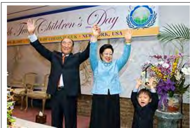
True Parents celebrate the 48th Children’s Day and cheer with their grandson.

True Father established Children’s Day at the former headquarters church at Cheongpa-dong in Seoul on October 19, 1960 (October 1 lunar). It was the second major Holy Day established by the church, following Parents’ Day, which had been declared on March 1, 1960 (lunar). Children’s Day signified the restoration of God’s direct lineage and opened the way for humanity to be engrafted into that lineage as God’s sons and daughters. Children’s Day continued to be celebrated annually according to the lunar calendar. At the 35th Parents’ Day in 1994, True Parents directed that the word “True” be placed before the names of the four major Holy Days (God’s Day, Parents’ Day, Children’s Day and Day of All Things).