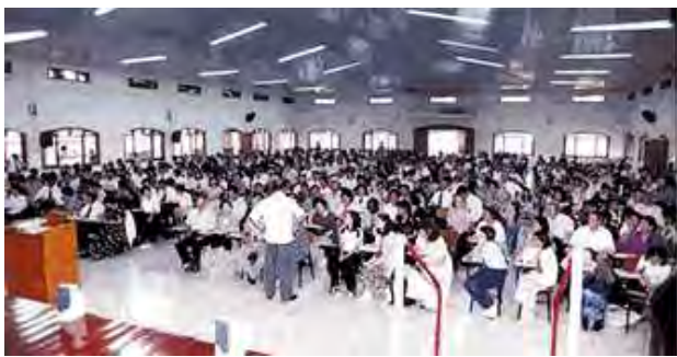
True Father speaks at New Hope Farm in Uruguay.

True Parents made South America a focal point of their work during the mid- and late 1990s. During a speaking tour of 23 Latin American nations in 1995, True Father emphasized the region's "stunning and abundant potential," noting that its "mountains, rivers and jungles hark back to the original state of creation." Having purchased land in the Brazilian outback that would become New Hope Farms, True Father began exploring the Paraguay and Amazon Rivers in 1997. He pointed out that the Paraguay River divides the continent east and west and the Amazon divides it north and south, but that their sources were only four kilometers apart. He envisioned that area being preserved as a "place of encounter where God, people and all things meet in a New Eden." He also envisioned representatives of the nations settling along the banks of the two rivers. In pursuit of this, True Father set out by boat on the Paraguay River in mid-summer. According to a travel companion: "Every 50 kilometers we set out a sign numbered on a stick. ... It was not easy to do that, because it is swampy ground covered with growth, and we had to clear the area; walking through the water and getting bitten by bees and ants. We set 63 signposts along the Paraguay River."