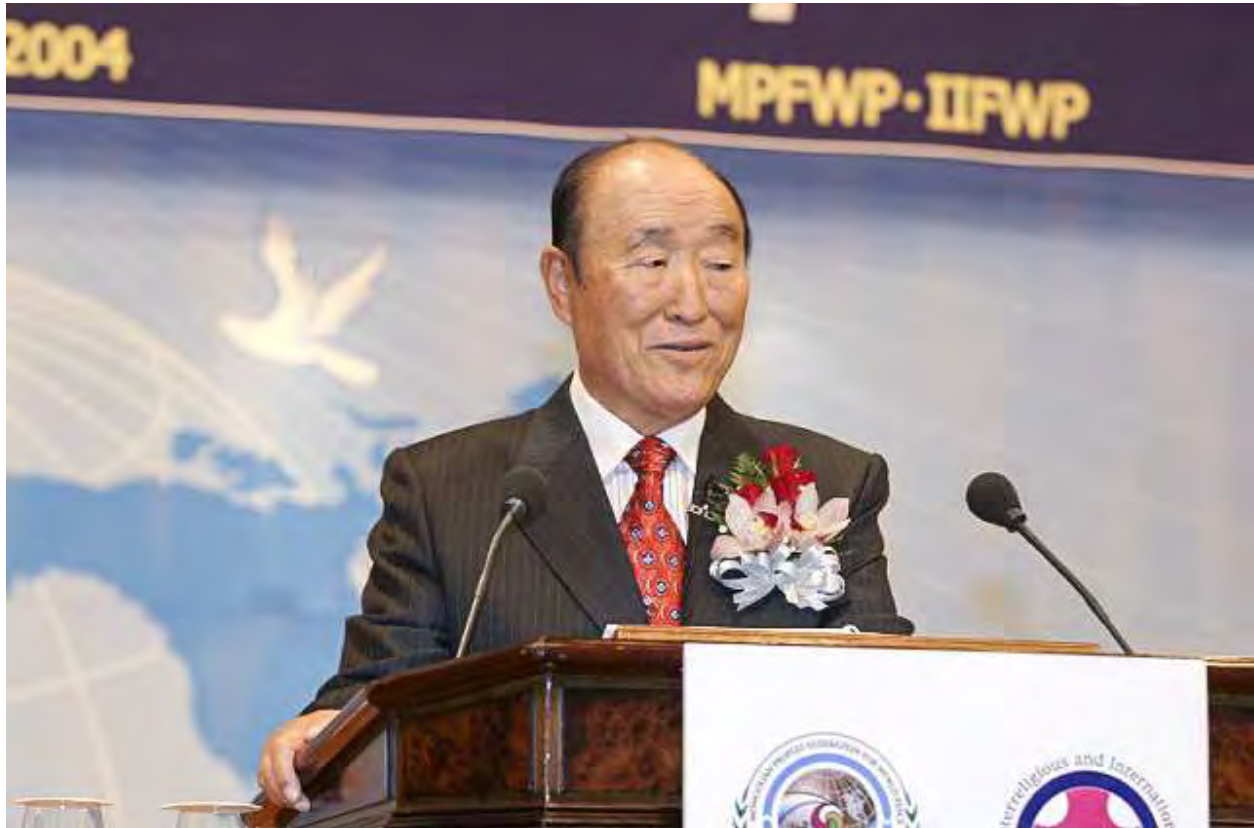
True Father speaks at the International Peace Conference for Mongolian Leaders from Around the World

True Father established numerous Federations for World Peace following the end of the Cold War and into the new millennium. From September 21-24, 2004, the first International Peace Conference for Mongolian Leaders from Around the World took place in Seoul. This conference led to the creation of the Mongolian Peoples' Federation for World Peace (MPFWP). True Father defined Mongolian peoples as those born with the Mongolian birthmark, a bluish mark usually seen on the backside. He asserted that nearly three-quarters of the world's population is linked to Mongolian roots and that the Mongolian birthmark appears not only in persons of the yellow race but also among many black and white people. He maintained that values preserved among Mongolian peoples, such as faith in absolute values, an understanding of human spirituality, belief in the existence of the spirit world, an emphasis on family tradition and the importance of lineage would play a significant role in bringing about the realization of a world of peace. The initial conference brought together 300 participants from Mongolia, Korea, Japan, China and 34 other nations. The Mongolian Federation convened subsequent meetings under the auspices of the Universal Peace Federation.