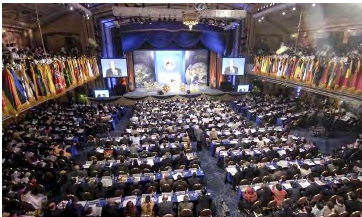
True Father launched the "Substantial" Abel UN at the Manhattan Center