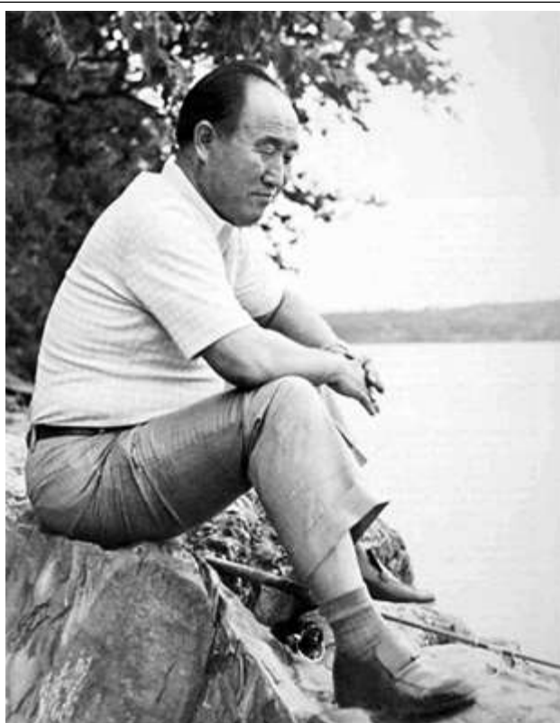
True Father fishing on the Hudson River near UTS circa February, 1980

In early 1980, elders of the Unification Church were eagerly preparing to celebrate True Father’s 60th birthday. This was because in East Asia, the 60th birthday has special significance, meaning that a person has completed the five 12-year cycles of the Oriental zodiac. It signifies accomplishing one big cycle in one’s life and starting another and is considered the most significant birthday in an individual’s lifetime. Therefore, church leaders were immersed in a multitude of detailed preparations for that celebration. However, unexpectedly True Father summoned Col. Bo Hi Pak and asked him to abandon all plans for a celebration and immediately go to Latin America. He had intuited the need for a new initiative to support Latin American governments which were increasingly under pressure because of the communist takeover of Nicaragua in 1979 and the growth of communist insurrection in countries such as El Salvador, Guatemala and Peru. He gave Col. Pak instructions to establish contacts and offer resources in educating young people, the military and civic leaders so as to avoid a fate similar to Nicaragua’s. This led to the founding of CAUSA International and a new chapter in