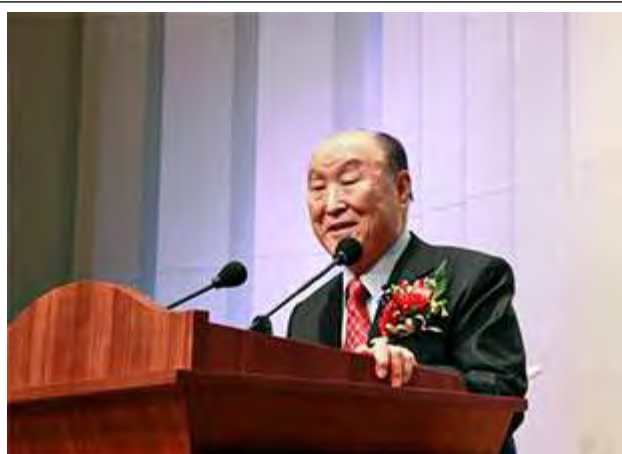
True Father at the opening of the Cheon Bok Gung

Bok Gung began in earnest with the acquisition of a large public building in Seoul's Yongsan district. The church's worldwide membership, led by Japan and Korea, donated nearly $100 million for the purchase and subsequent renovation costs.