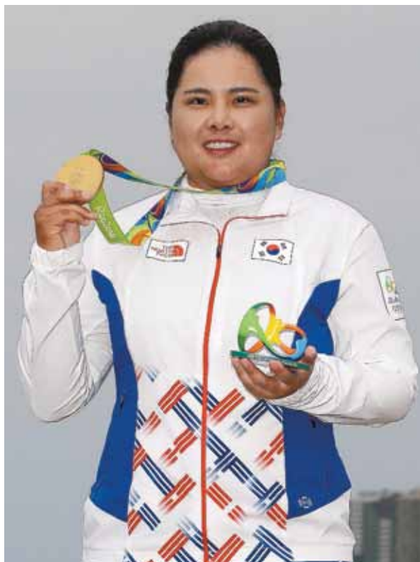
In this Aug. 20, 2016, file photo, Inbee Park, of South Korea, holds up her gold medal after the final round of women's golf at the Summer Olympics in Rio de Janeiro, Brazil.