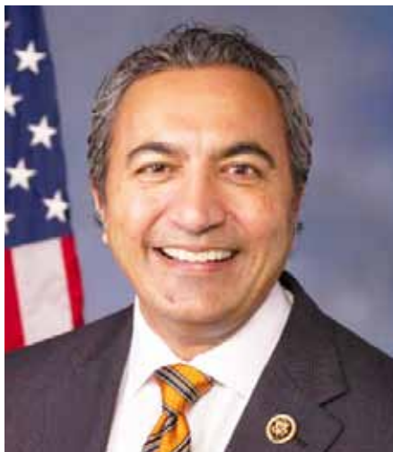
By U.S. Rep. Ami Bera, M.D.

Earlier this month, I had the pleasure of traveling to South Korea with my House Foreign Affairs Committee colleagues. On April 27, I will have the honor of welcoming President Yoon Suk Yeol as he addresses a joint meeting of Congress during his visit to the United States. President Yoon's visit commemorates the 70th anniversary of the alliance between the United States and the Republic of Korea (ROK, as South Korea is officially known)—an alliance based on mutual security and economic interests, as well as dedication to the rule of law, human rights, and democracy.