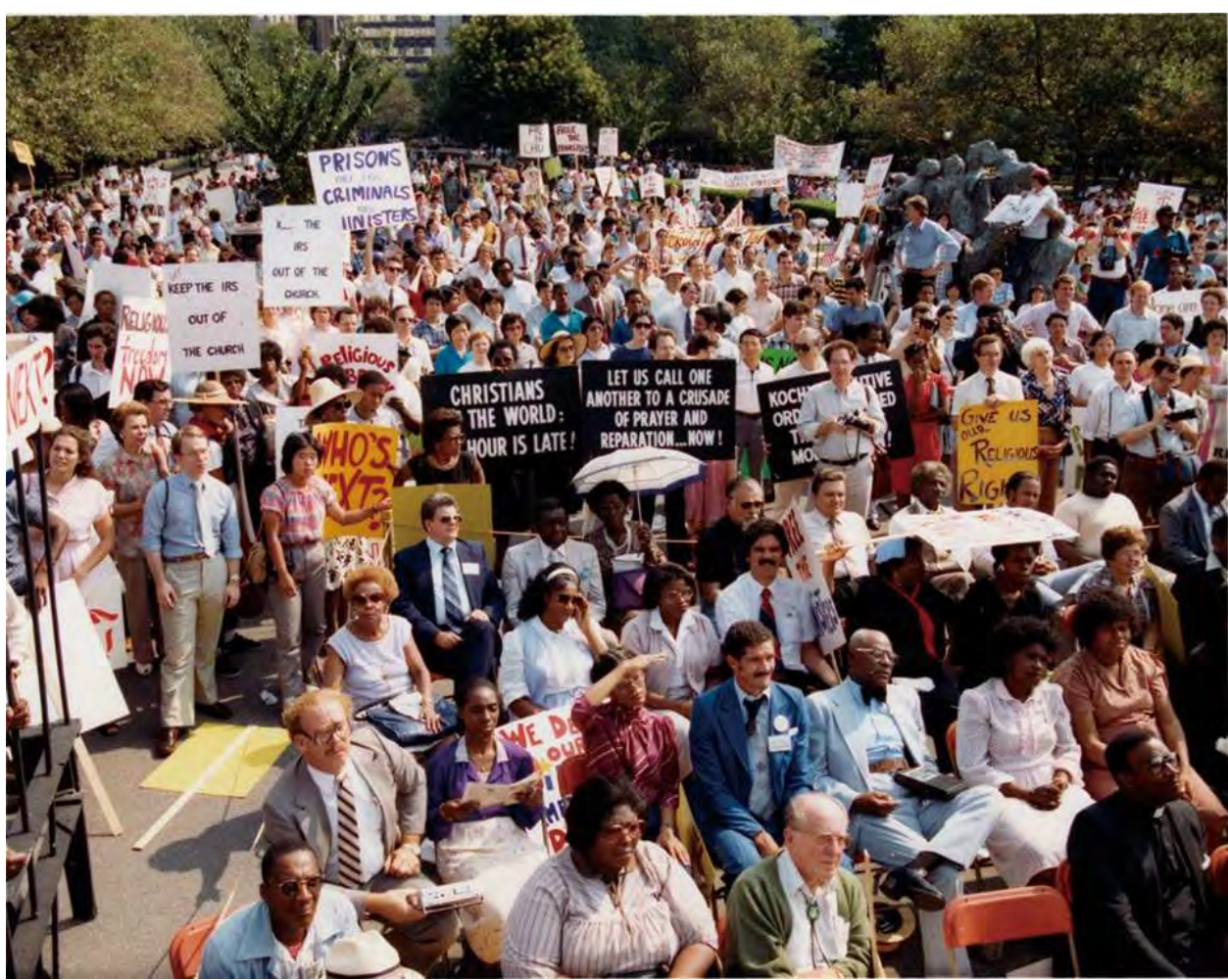
Mainstream Christians, who saw in Father's unjust prosecution a broader threat to the free exercise of religion in America, joined forces with our members in protests such as this.