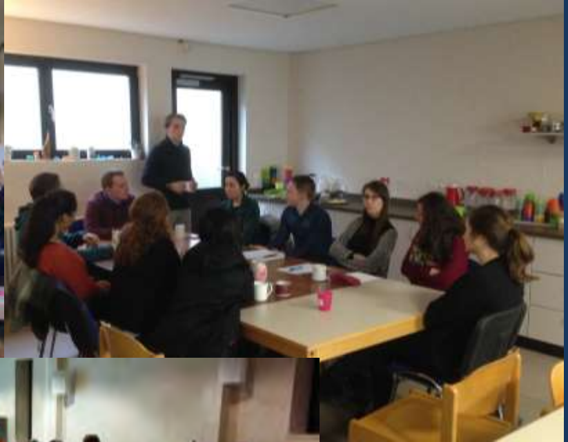
Social Work Breakout Session