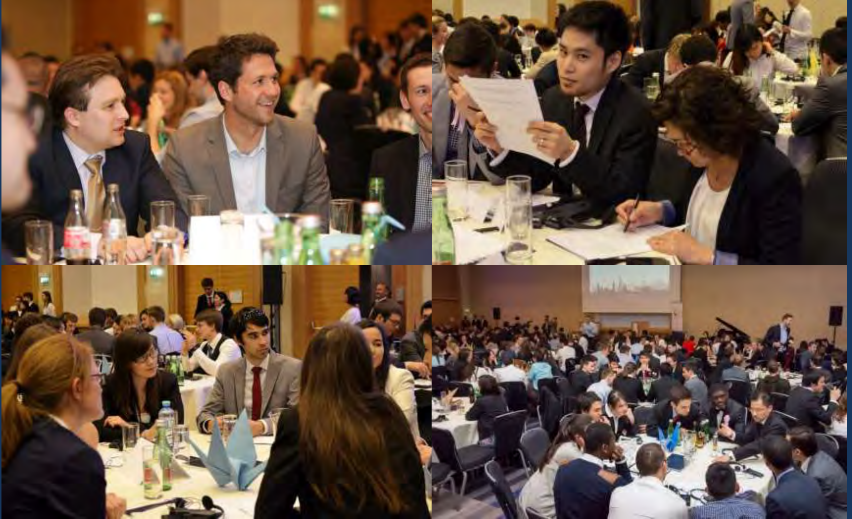
Cranes Club European Kick-Off Vienna, May 10, 2015 400 participants