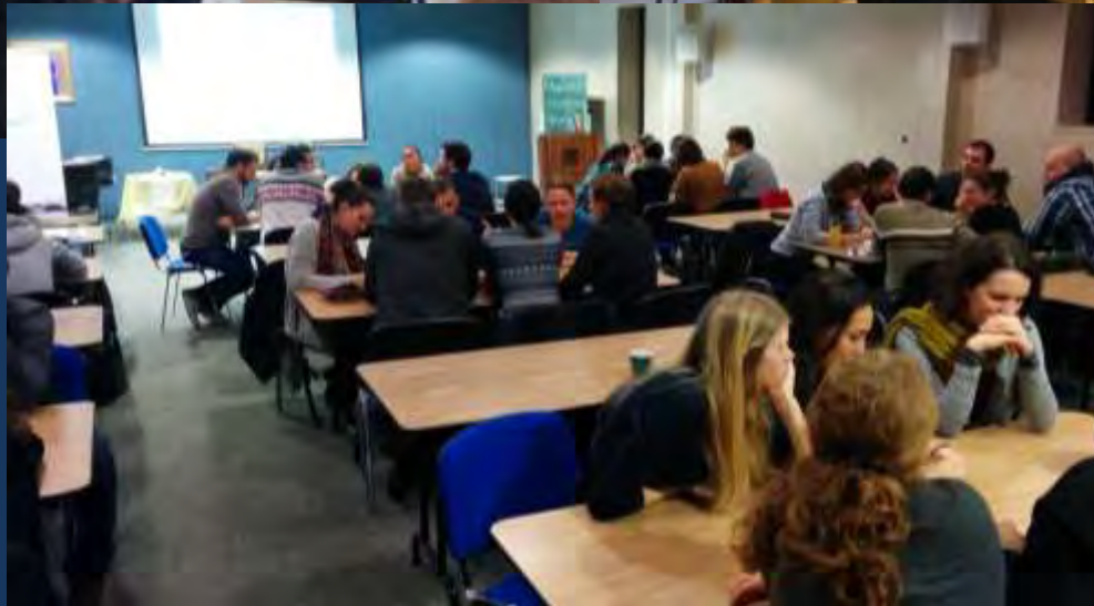
Ice Breaker Groups

1 st European Cranes Club Conference Bad Camberg, Germany, January 8 th – 10 th 60 participants + staff