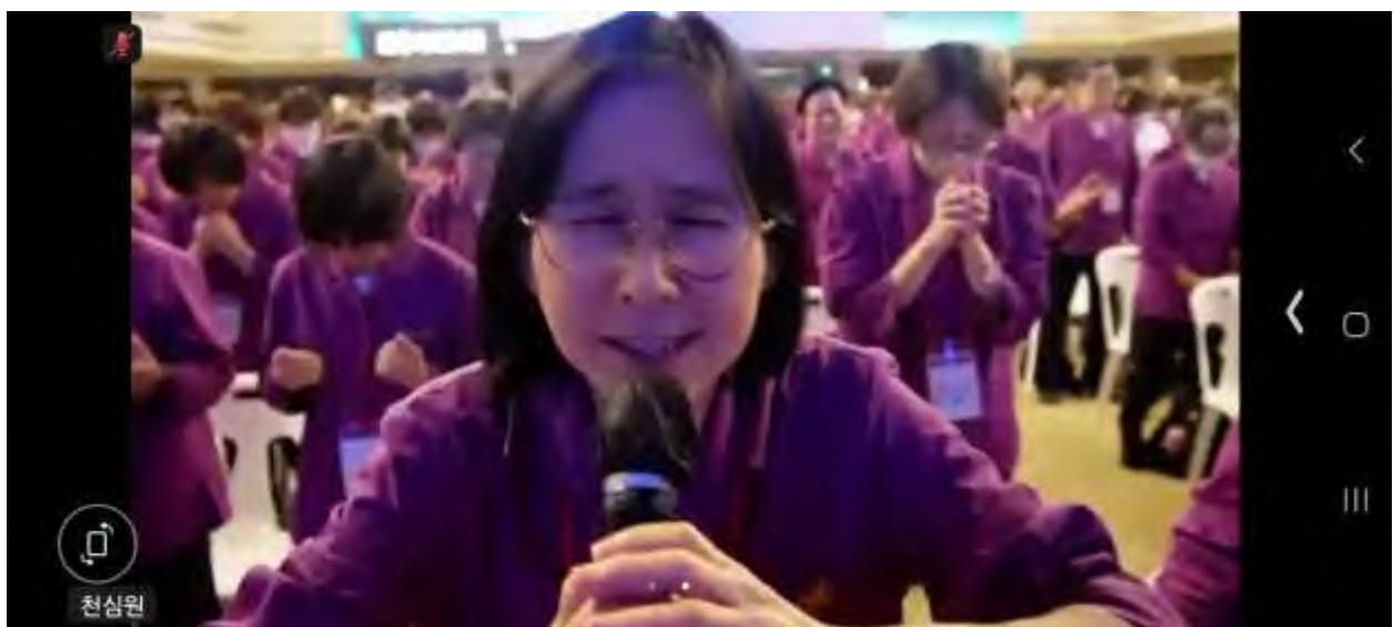
Video H America

Cheon Shim Won Overseas Volunteer Corps at Workshop