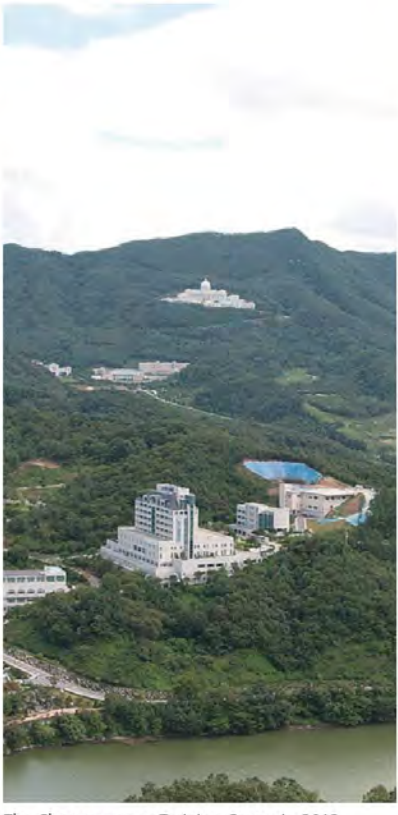
The Cheongpyeong Training Center in 2012