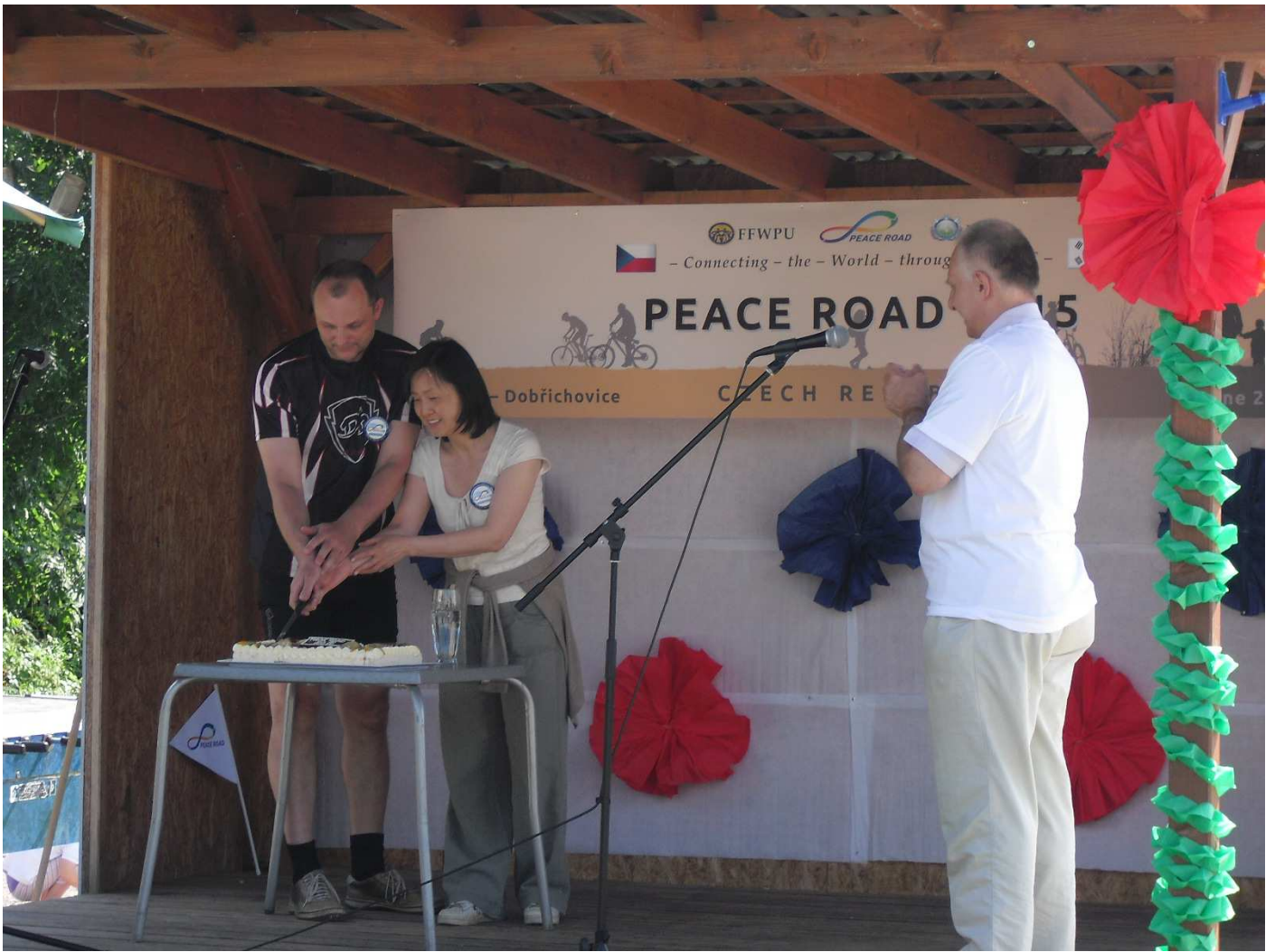
Cutting the Victory Cake.