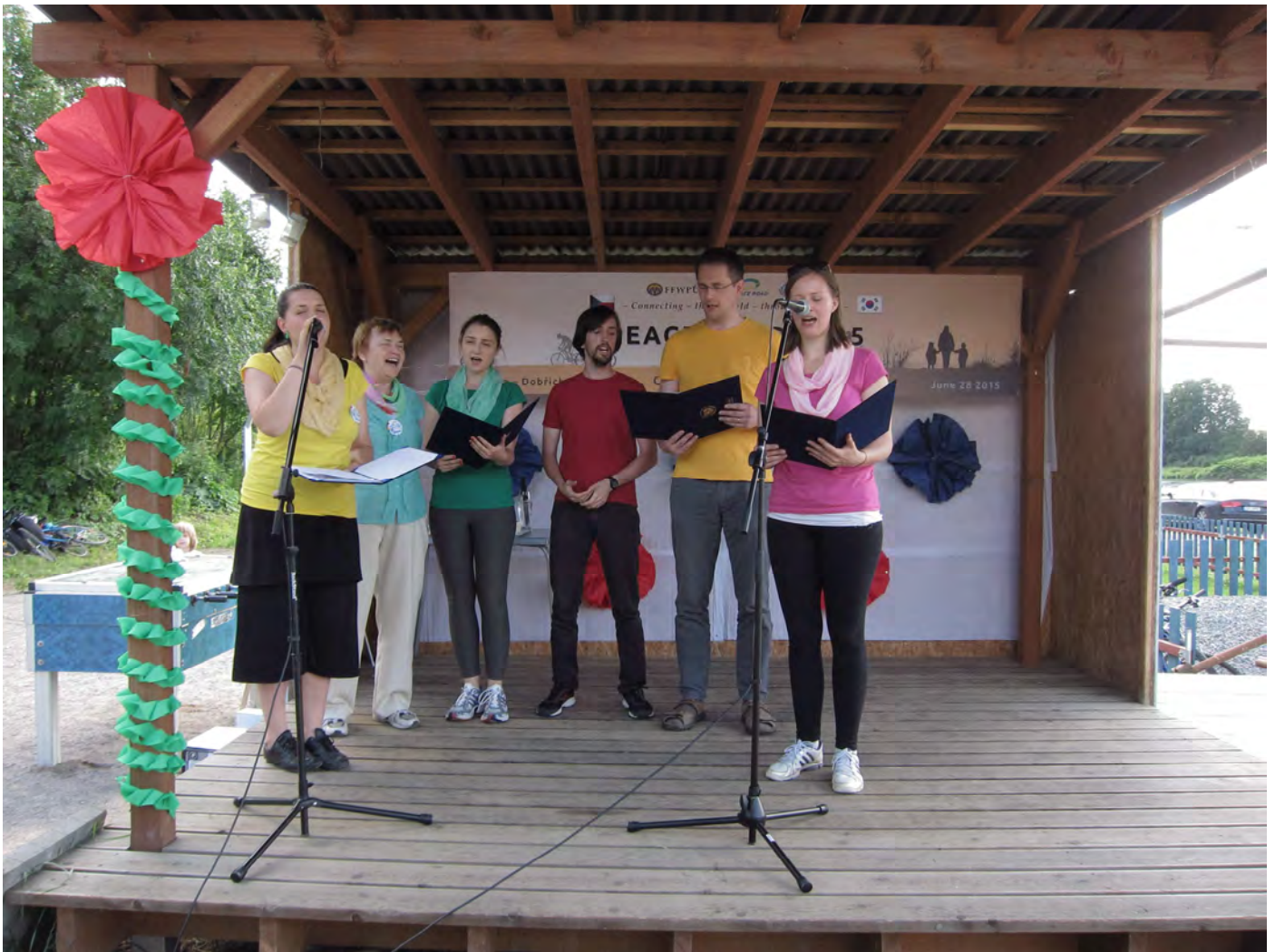
Our Music Ministry choir sang Arirang and Tongil.