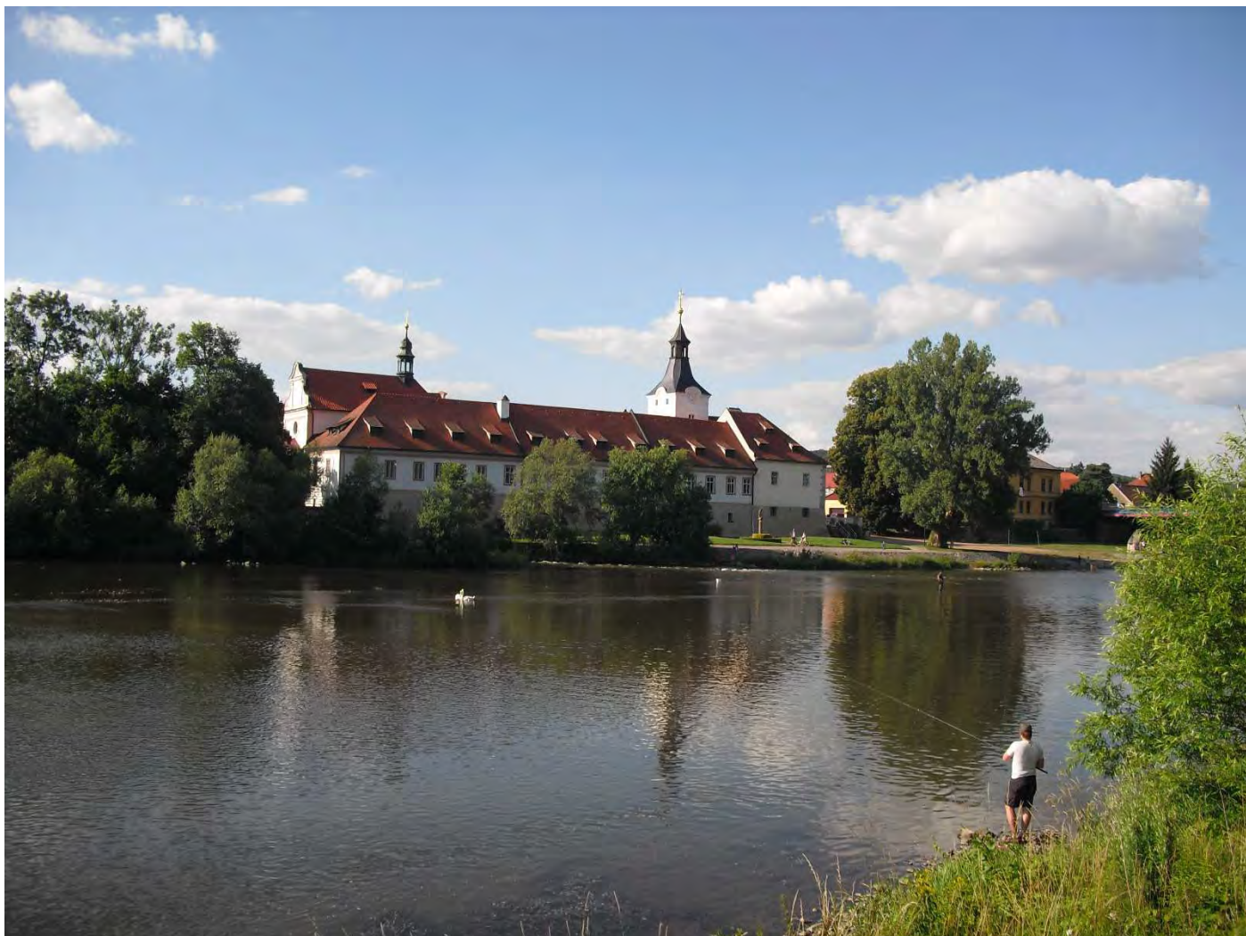
Town of Dobřichovice.