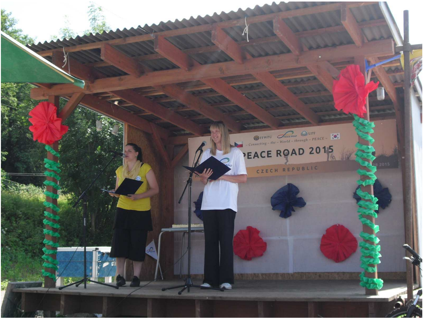
At the destination, the camping restaurant “Weir of Good Hope”, sounded speeches by the National Leader and the UPF Secretary General in testimony to True Father as a Peace Maker, who visited North Korea, to embrace the dictator Kim Il Sung, and who was striving all his life, to see the Korean peninsula united.