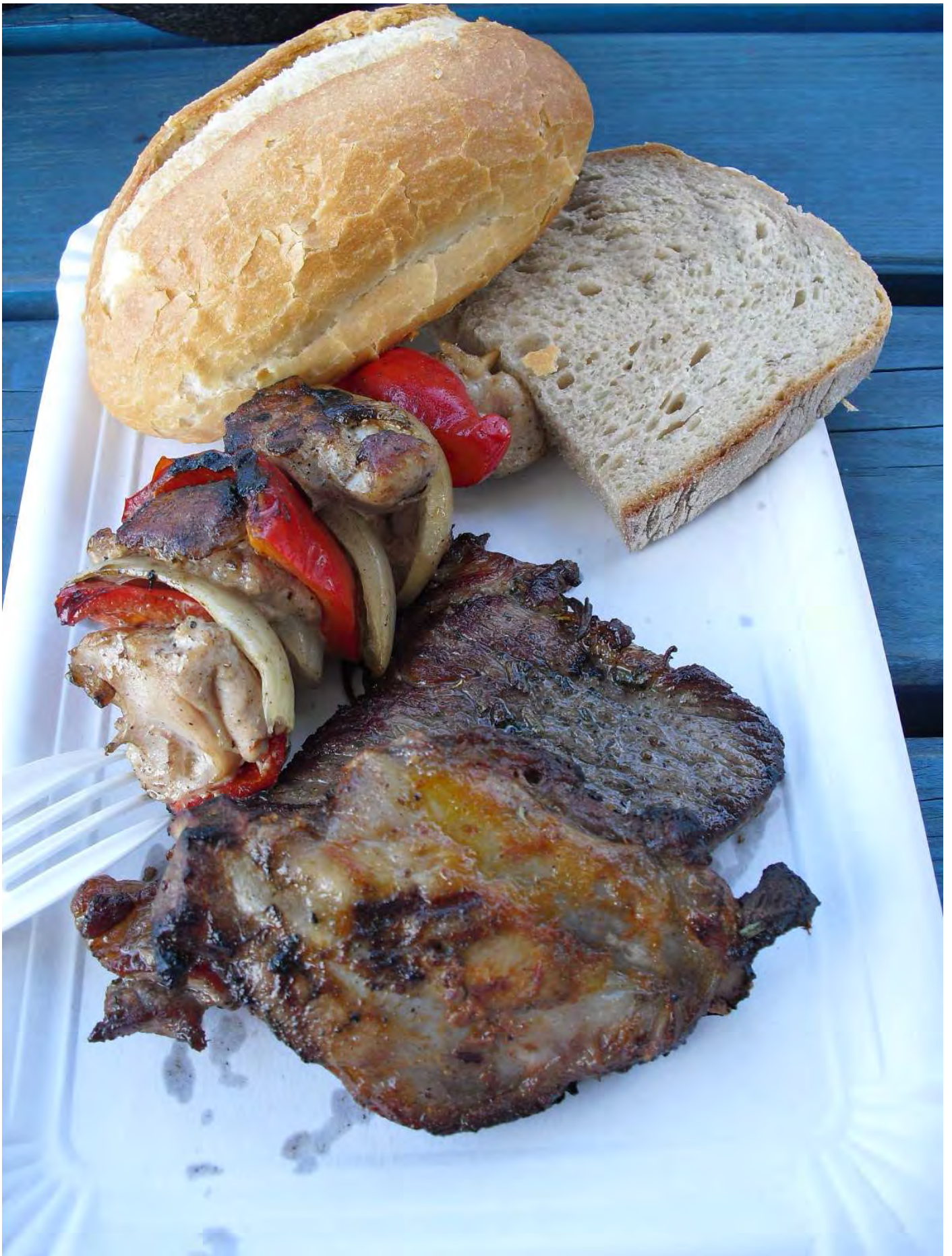
At the destination, there was bbq and cake for everyone.