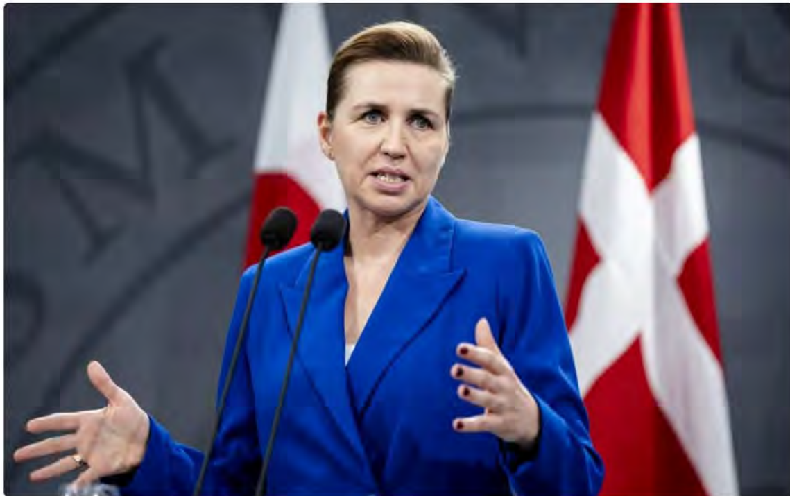
Danish Prime Minister Mette Frederiksen

Danish PM Frederiksen has taken up the concept of spiritual rearmament, although the meaning remains unclear