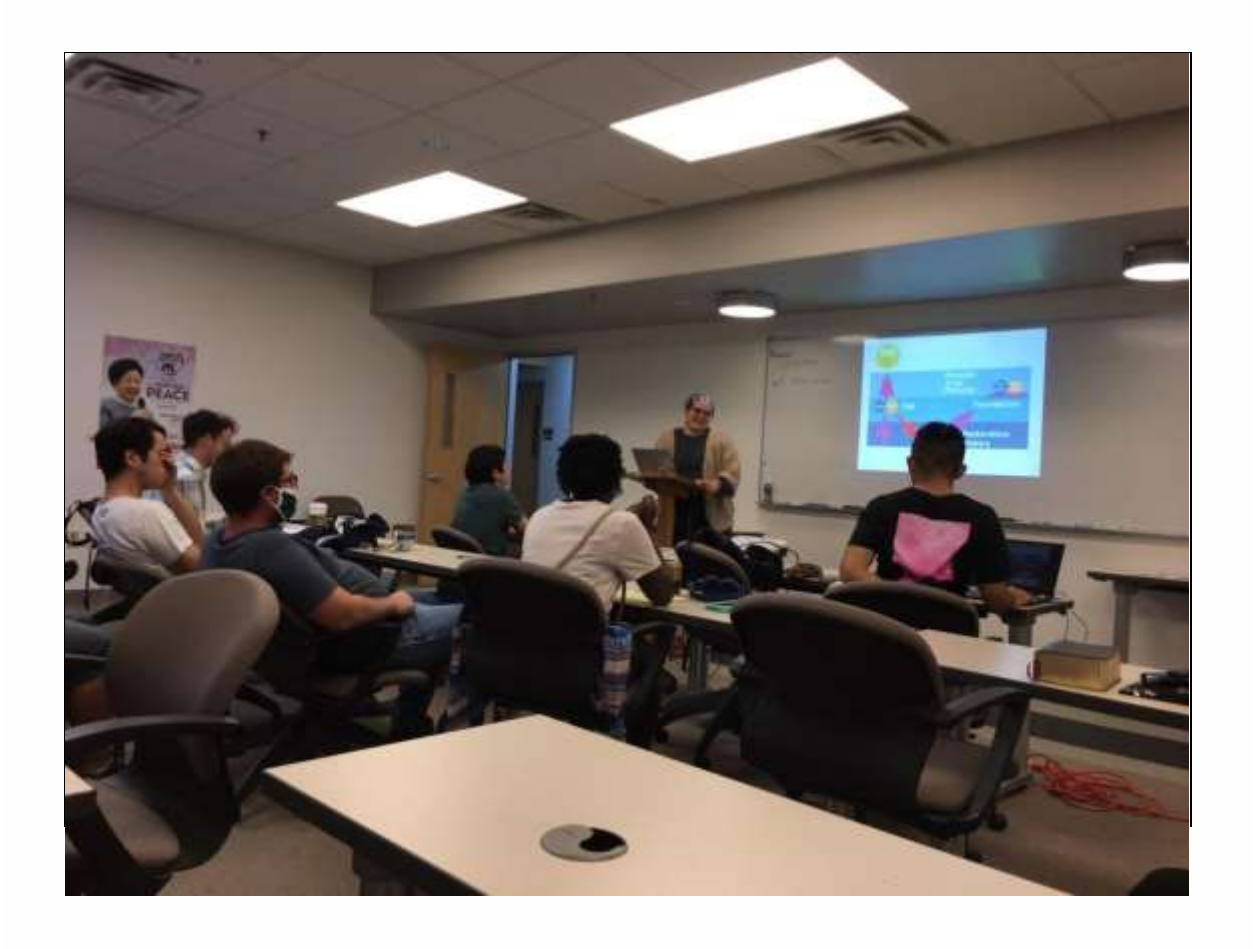
CARP: North Lake

The Dallas YAM group organized their first Trivia Night and young adults from around the subregion joined in on the fun (and educational) event.