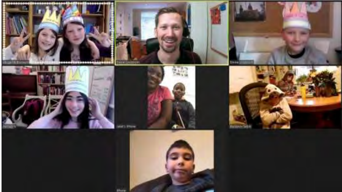
Mountains (7-11 years old)