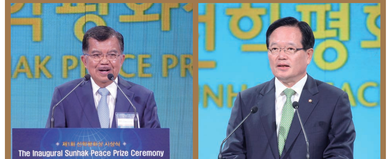
▲ Congratulatory Address: H.E. Muhammad Jusuf Kalla, Indonesian Vice President