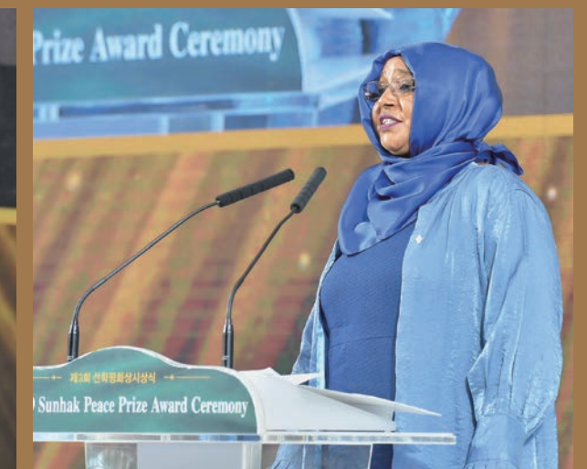
▲ H.E. Seynab Abdi Moalim, The First Lady of Somalia