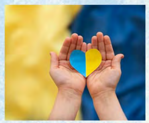
TIME AND PLACE: APRIL 7, 2024 AT 12:30, COLORADO FAMILY CHURCH (MAIN HALL)

DONATE: HTTPS://GIVESENDGO.COM/TWOYEARSOFBRAVERY