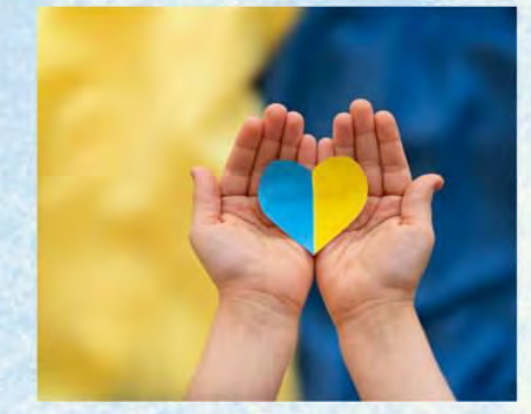
TIME AND PLACE: APRIL 7, 2024 AT 12:30, COLORADO FAMILY CHURCH (MAIN HALL)

DONATE: HTTPS://GIVESENDGO.COM/TWOYEARSOFBRAVERY