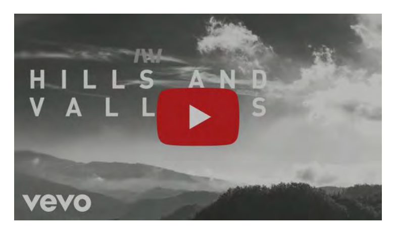
Offering Song: Hills and Valleys by Tauren Wells