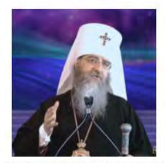
Archbishop Metropolitan Chysostomos Celi