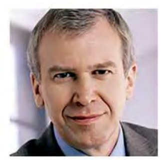
H.E. Yves Leterme