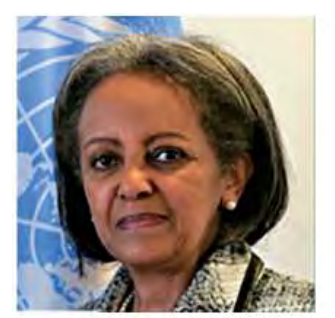
H.E. Sahle-Work Zewde