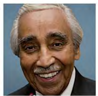
H.E. Charles Rangel