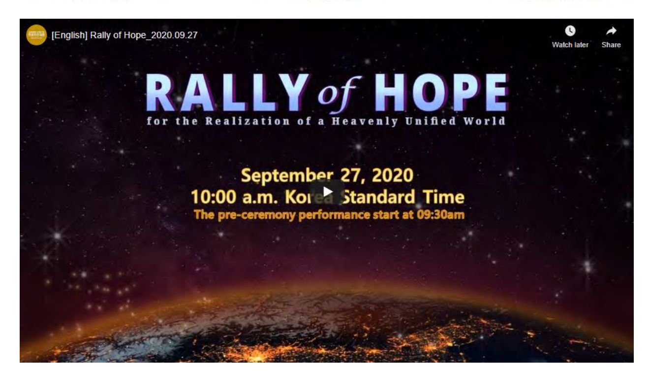
Don't miss out! Watch the full recording of the second rally of hope here.