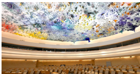
Human Rights and Alliance of Civilizations Room

February 25 - March 22, 2019 - UN at Geneva