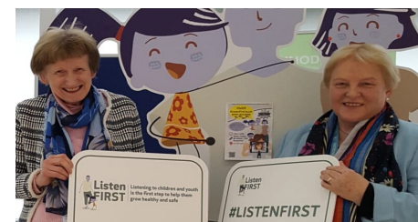
WFWPI Reps at the Listen First stand

In response to these recommendations, the Director of the UNODC, Mr. Yury Fedotov took a clear stand, stating, “All our societies would be better off if more resources were devoted to supporting evidence-based drug prevention strategies, which are a sound and effective investment in families, schools and communities.” Mr. Fedotov went on to recall UN Secretary General António Guterres’ statement given on the International Day Against Drug Abuse and Illicit Trafficking in 2018: “I urge countries to advance prevention, treatment, rehabilitation and reintegration services; ensure access to controlled medicines while preventing diversion and abuse; promote alternatives to illicit drug cultivation; and stop trafficking and organized crime – all of which would make an immense contribution to our work to achieve the Sustainable Development Goals.”