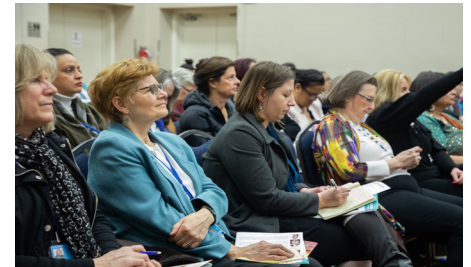
Parallel Event audience