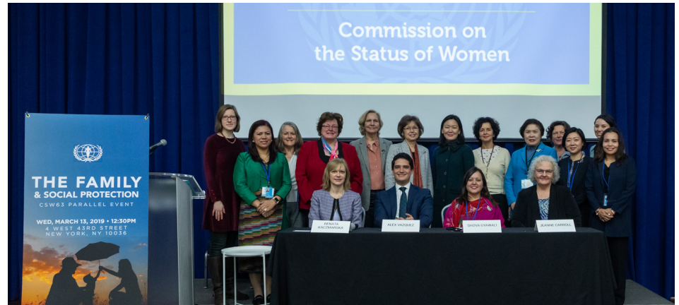
CSW63 Parallel Event Panelists and WFWPI International Vice Presidents

March 13, 2019 - 4 West 43rd Street, New York City