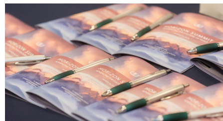
Horizon Summit program booklets

The Horizon Summit is an intergenerational gathering dedicated to fostering peace leadership that was initiated four years ago as an annual component of WFWPI's broader CSW week. The 2019 Horizon Summit, co-sponsored by WFWP, International and WFWP, USA, was held on Saturday, March 16 at 4 West