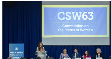
CSW63 Parallel Event Panelists

On Thursday, March 14, WFWPI hosted a casual evening of delicious food, games, and networking for young professionals that were participating in CSW63, as well as friends and colleagues of WFWPI. WFWPI guests look forward to this time set aside each year for the young professionals to gather and enjoy one another's company.