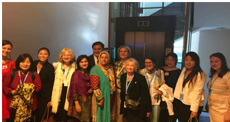
NGO advocates at the HRC

In his speech, UN Secretary General Mr. Antonio Guterres explained that he had grown up under a dictatorship and that he has personally experienced how human rights can drive progress and ignite hope out of desperation. “Human rights are the DNA of the Founding Charter,” he added. “I will not accept a civilization that says to my granddaughter that she must wait two more generations for economic parity. Thank you for prioritizing the Right to Development, but unequal benefits are causing social tensions, which must be remedied. There are 4 environmental activists killed each week and we cannot tolerate impunity. The HRC aims to push boundaries, bring out our best, and allow us to live up to our potential.”