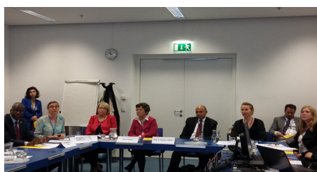
CCPCJ Side Event panelists

the education of its citizens. The Ambassador went on to stress the importance that a society embrace all human rights, especially Article 2 of the Universal Declaration of Human Rights against discrimination at all levels and promoting inclusive societies. In promoting an inclusive society, the Ambassador said that four elements needed to be present: education, especially in relation to what human rights are and how to live in accordance with those rights; a legal framework to protect the human rights standard; civil society as voice to promote rights and criticize against measures that lead to human indignity; and a generation of enlightened people. H.E. Mr. Ortiz closed on a positive note, stating that the motto of the 2030 SDGs — “Leave no one behind” — can be fulfilled if everyone takes responsibility.