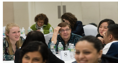
Participants enjoy a discussion at their table

which can enable harmony rather than division which is a skill set that can lead not only to a more gender equality but ultimately a more peaceful world. Following each speaker an interactive discussion was facilitated at each table where participants were encouraged to share their own insights on the topics and engage with the idea of themselves as peacemakers.