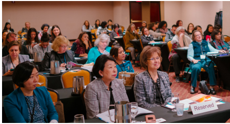
CSW63 participants at the WFWPI Orientation