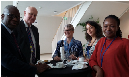
WFWPI event organizers and panelists