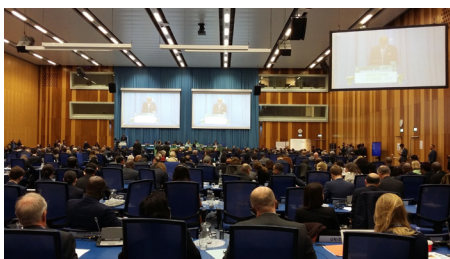
Opening of the CND in Vienna