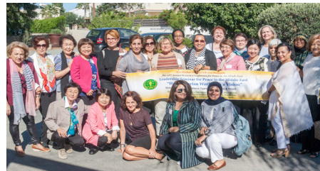
Participants in Cyprus