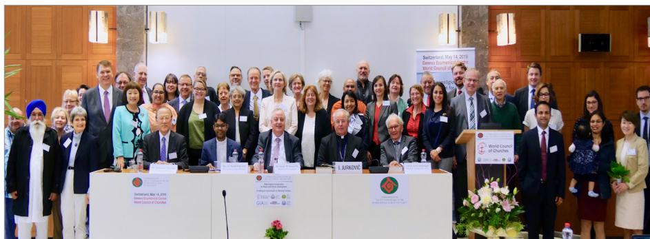
Participants at the Opening Session

May 14, 2019 - Ecumenical Conference Hall