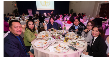
Delegation from the Philippines at the banquet dinner