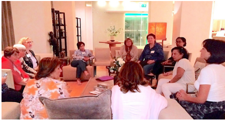
Drafting meeting in Cyprus