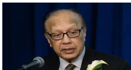
Ambassador Chowdhury gives the keynote address

Movement for The Culture of Peace (GMCoP).