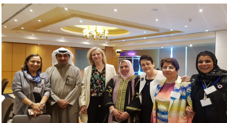
Women's Pioneer for Peace 1325 and WFWPI