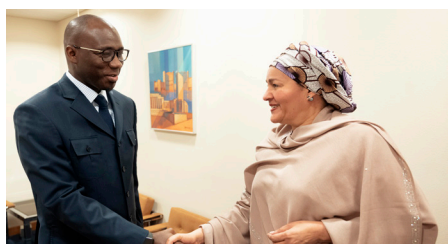
HRC President Coly Seck & UN Deputy SG Amina Mohammed