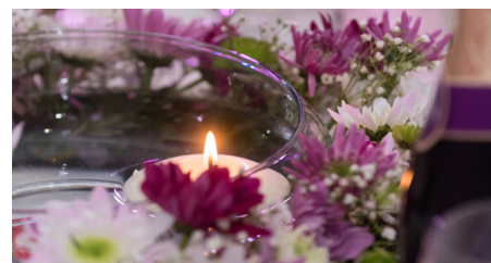
Banquet table decorations

Late in the afternoon, participants were encouraged to reflect on their own contributions to advancing The Culture of Peace by engaging with interactive rooms where they could share their personal stories, declare their action steps, and express through words and illustrations what The Culture of Peace means to them.