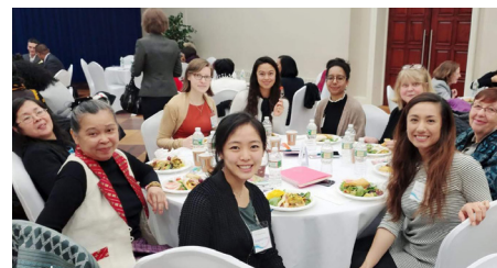
Interactive discussions at the Horizon Summit

Learning means changing, and attending CSW has changed me a lot. So many presentations, people, conversations and experiences within those 8 days have molded me. I see the world with different eyes. The world is so much more messed up than I thought, but there are also many more people and organizations who try to improve it. I feel despair and hope at the same time. But most of all I feel determined - we have to stop this suffering now! Within 8 days I have heard so many heartbreaking stories, made new friends, seen amazing African hairstyles, passed by so many homeless and mentally ill people, seen so much pollution and trash, and stared up at giant skyscrapers everywhere! I understand better how the UN during this annual conference tries to agree on suggestions to the countries on how to improve the lives of women, while NGOs try to influence the people in that UN committee, the papers, each other and the over 4000 participants of CSW63.