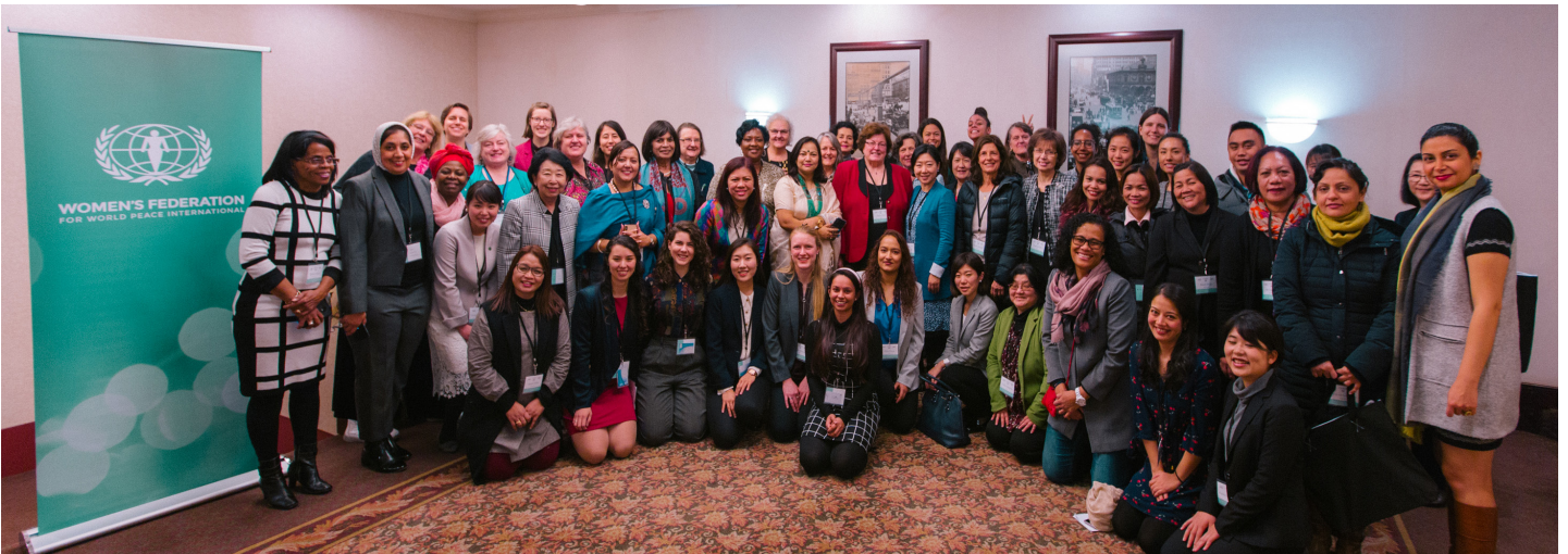
Participants gather at the New Yorker Hotel for the WFWPI CSW63 Orientation