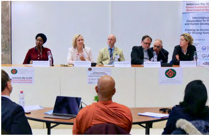
Panel on War and Crisis Zones: Maintaining Familial Resilience