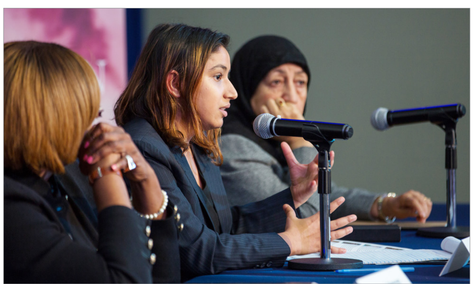
Panel discussion on peace leadership at the 2018 Horizon Summit

An intergenerational gathering dedicated to fostering peace leadership March 18-19, 2018 - New York City