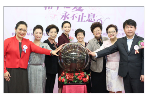
Launch of WFWP Taiwan's Innovative Development Plans of 2018