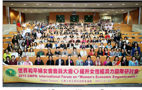
International Forum on Women's Economic Empowerment