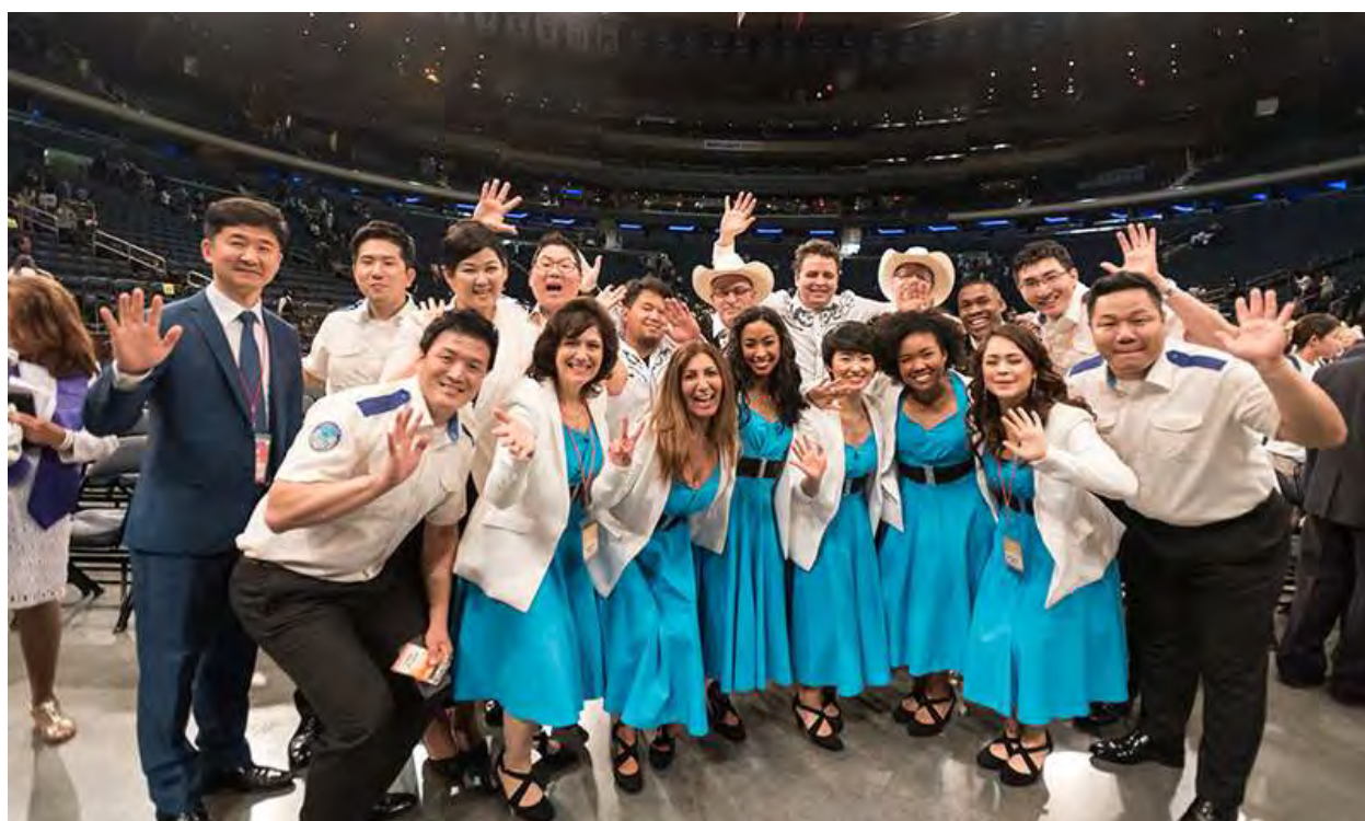
Apple Heaven at Madison Square Garden after the show

I'm lucky enough to live in New York where I can get very cheap lottery tickets to the Met Opera. Every night they have some of the world's top talent, greatest productions, best conductors, and top opera orchestras into that opera house. When the lights go down, the performance on stage has no regard to who's in the audience. No matter how famous or humble anyone is, we all have the same capacity to be profoundly moved.